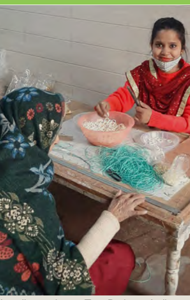
Jewellery artisans, Tara Projects, India