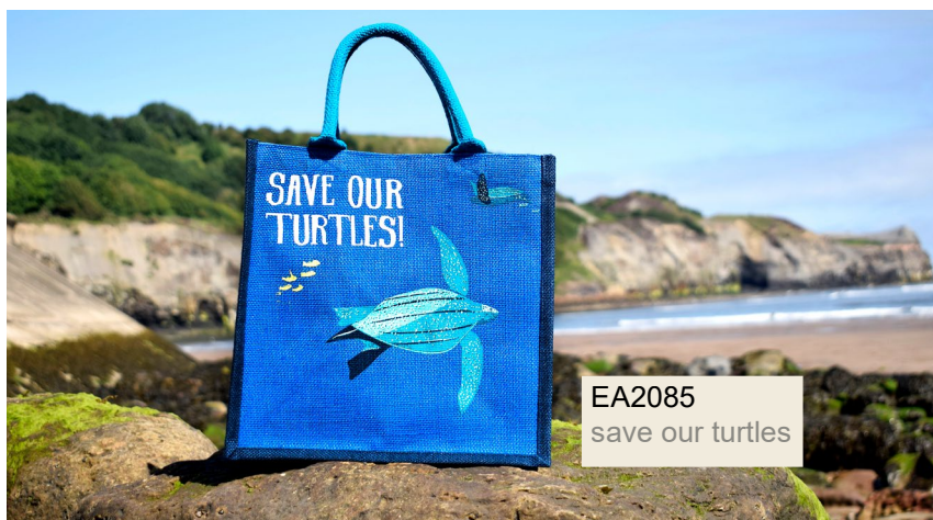
EA2085 save our turtles