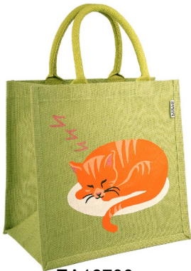
EA16700 cat sleeping