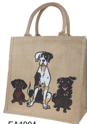
EA1904 walkies TOP SELLER