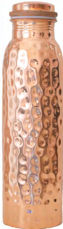
COP05 copper water bottle hammered 900ml