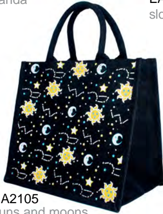
EA2105 suns and moons