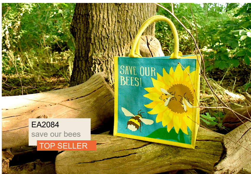
EA2084 save our bees