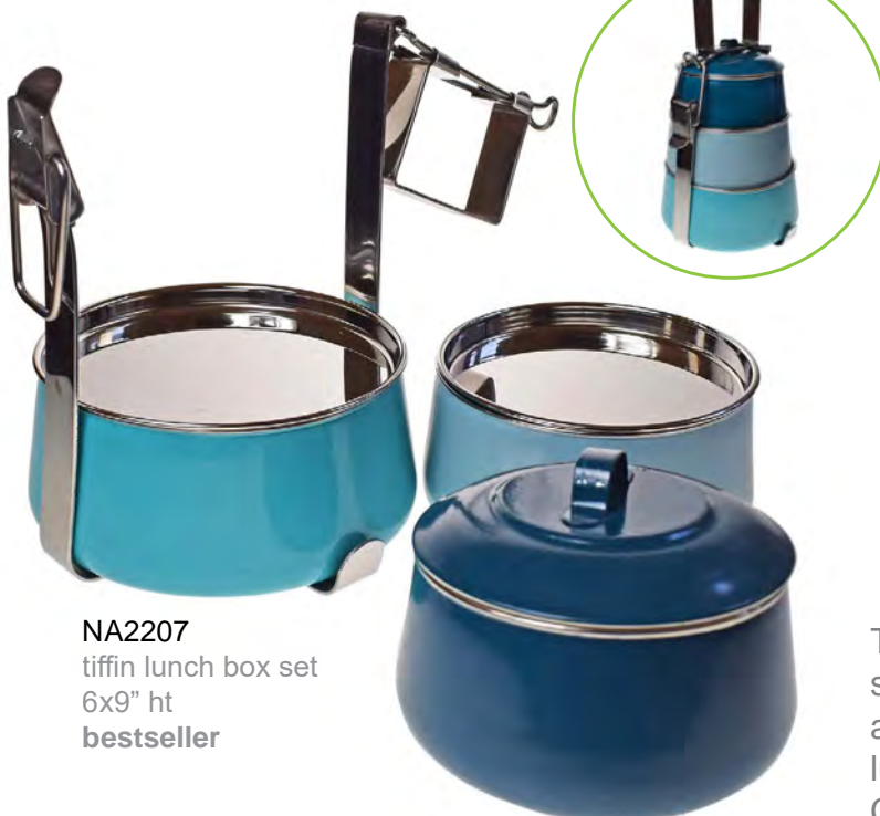
NA2207 tiffin lunch box set 6x9" ht bestseller

Two zero waste, high quality stainless steel lunch boxes from India. A great alternative to throw-away plastic lunches – use them again and again. Can also be used for storage.