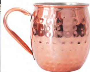
COP12 copper 'mule' mug 450ml