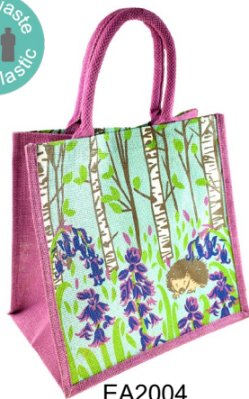
EA2004 hedgehogs in wood