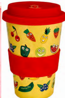
RH049 fruit and vegetable faces