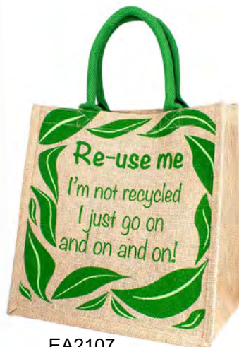
EA2107 re-use me