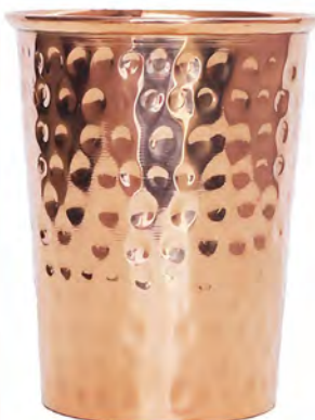
COP08 copper glass hammered 300ml