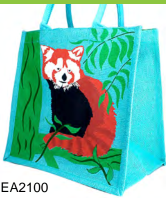
EA2100 red panda