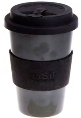
RH034 charcoal bestseller