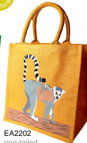
EA2202 ring-tailed lemur