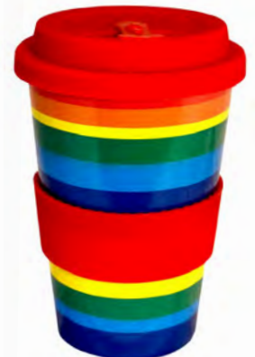
RH052 rainbow bestseller