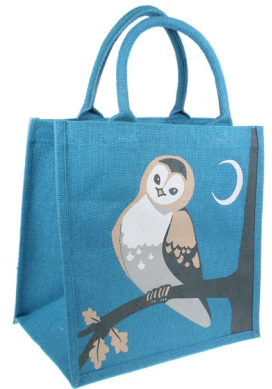
EA1874 owl & moon