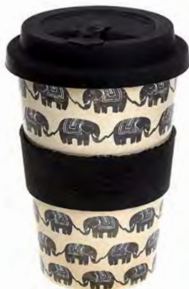
RH035 elephants bestseller