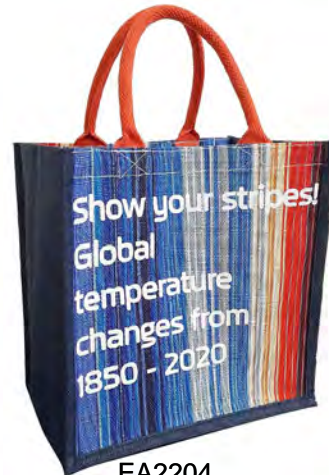
EA2204 show your stripes