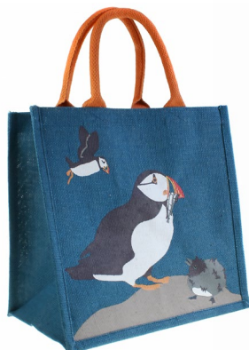
EA19703 puffin with chick