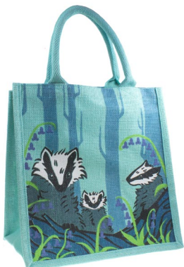
EA1900 badgers and bluebells