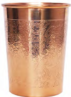
COP07 copper glass engraved 300ml