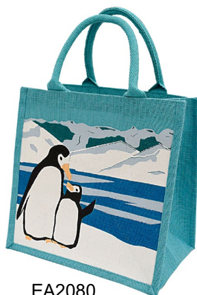
EA2080 penguin and chick