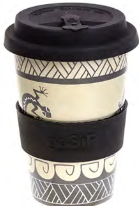
RH027 geckos & dragonfly