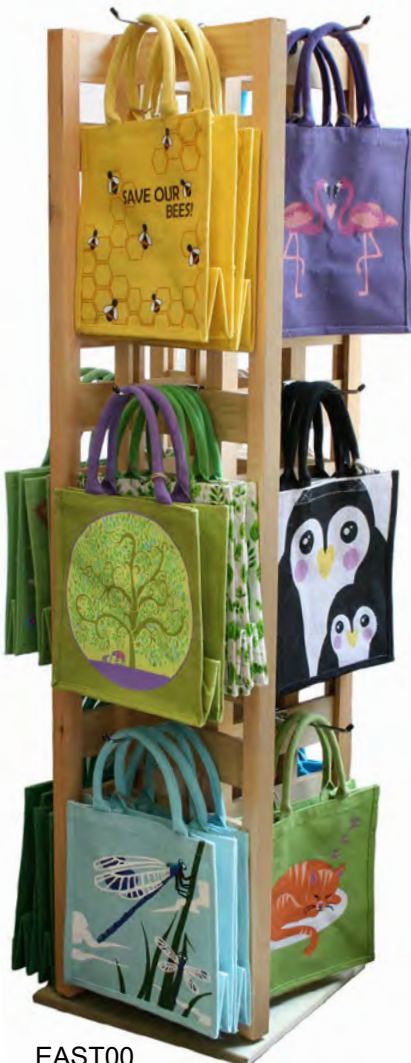
EAST00 POS display stand with 6 each x 24 jute bags