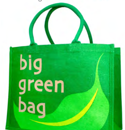
EA2109 big green bag 42x32x18cm