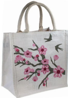
EA1803 cherry blossoms TOP SELLER