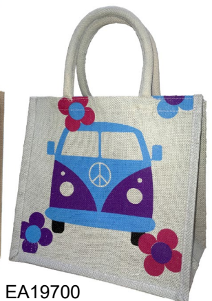
EA19700 camper van