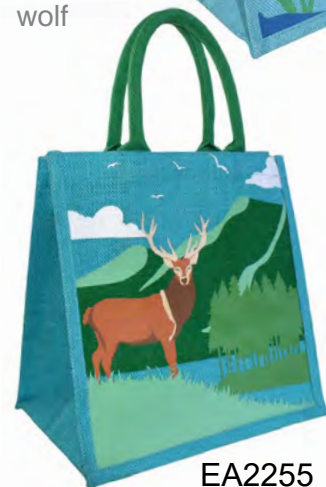
EA2255 red deer