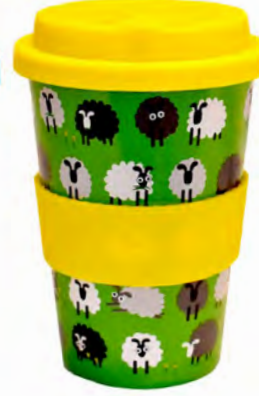
RH051 sheep bestseller