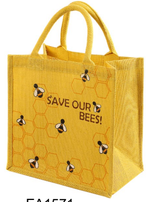
EA1571 save our bees