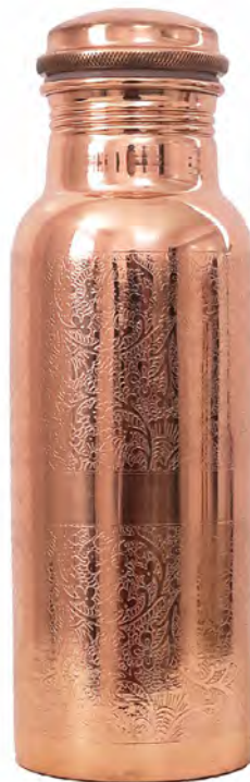
COP01 copper water bottle engraved 600ml bestseller

In the sea, they break down into micro-plastics, containing toxins (which are used in many plastics, to increase their durability) and absorbing pollutants from the sea. Eaten by fish, they affect the food chain and eventually ourselves.