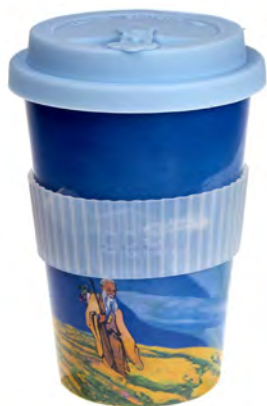
RH022 charaka pilgrim