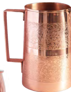
COP13 copper jug engraved 1.5 litre