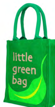
EA2108 little green bag 26x21x10cm