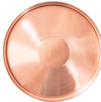
COP10 copper tray 32cm