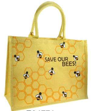
EA1771 save our bees 32x42x18cm