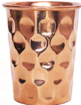
COP09 copper glass diamond 300ml