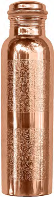
COP04 copper water bottle engraved 900ml