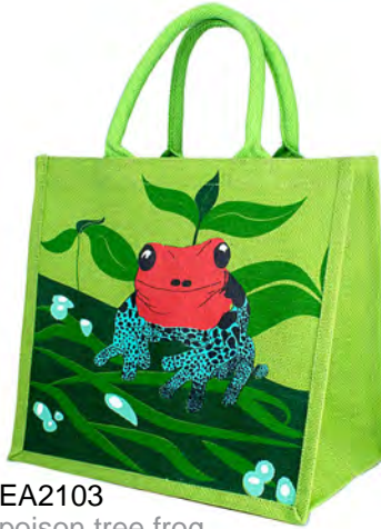
EA2103 poison tree frog