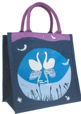
EA1902 moon swans