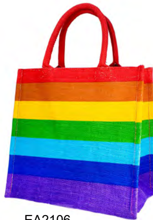
EA2106 rainbow TOP SELLER