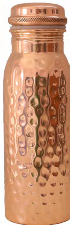
COP02 copper water bottle hammered 600ml bestseller