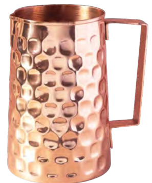
COP15 copper jug diamond 1.5 litre