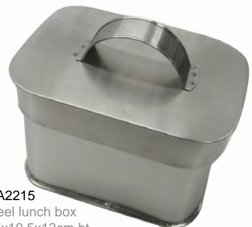
NA2215 steel lunch box 15x10.5x12cm ht