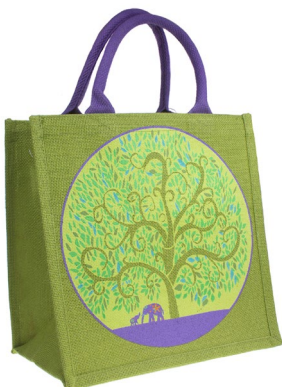
EA1901 tree of life & elephants