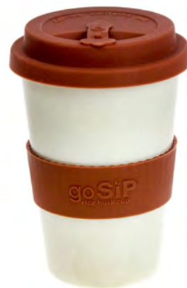
RH033 vanilla mocha