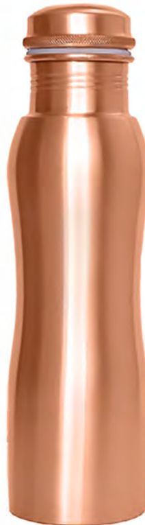
COP06 copper water bottle curve matt 900ml