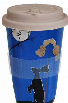
RH041 hare and moon