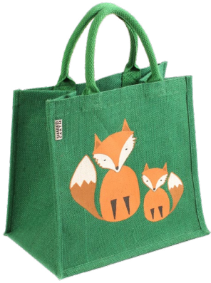
EA1572 fox & cub