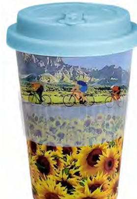
RH047 sunflowers and bikes