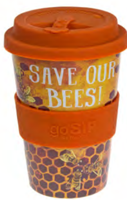
RH032 save our bees bestseller