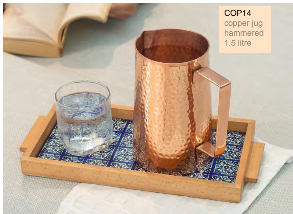
COP14 copper jug hammered 1.5 litre