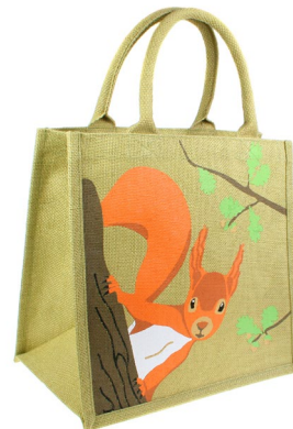
EA1873 red squirrel TOP SELLER