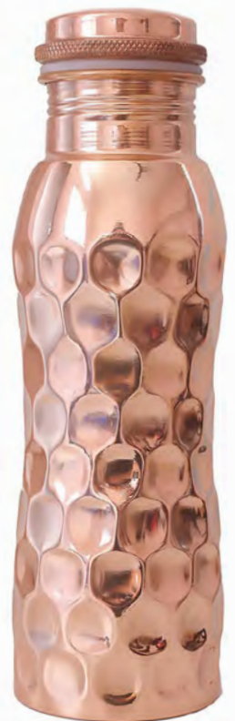
COP03 copper water bottle diamond 600ml bestseller