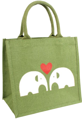
EA1302 elephants in love