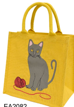
EA2082 cat and wool