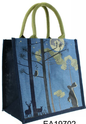
EA19702 hare & moon