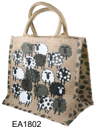
EA1802 sheep TOP SELLER