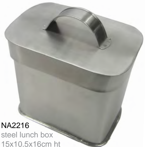
NA2216 steel lunch box 15x10.5x16cm ht