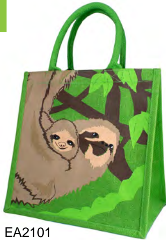
EA2101 sloth with baby