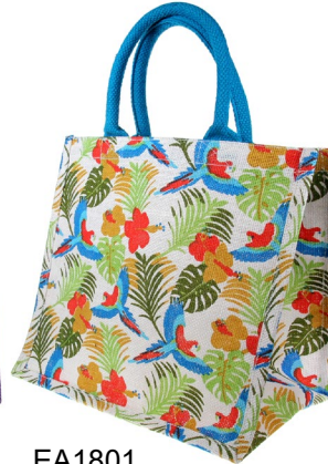
EA1801 tropical forest