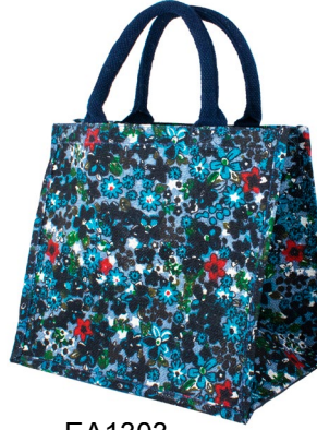
EA1303 floral blue