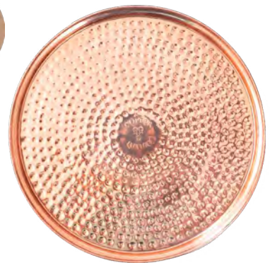
COP11 copper tray 32cm hammered