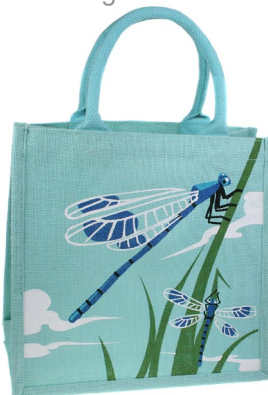
EA1872 damselflies TOP SELLER