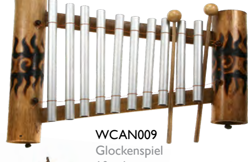
10 tube, non-western tuning