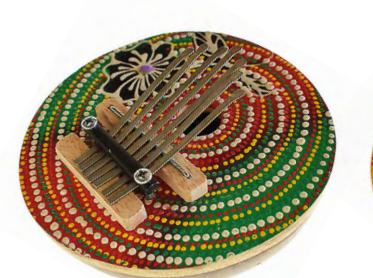
RZ1840 coconut shell red. It green 20cm