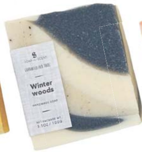
SNS174 winter woods