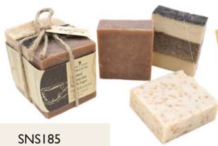
SNS185 'cafe' gift pack of 3