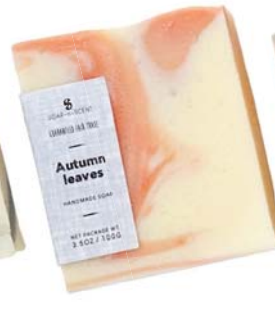
SNS175 autumn leaves