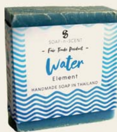
SNS153 soap 100g water