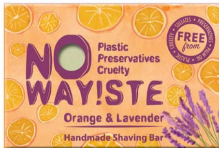
NW18 shaving bar orange & lavender