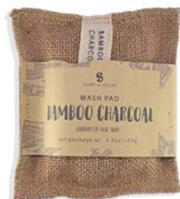
SNS165 bamboo charcoal