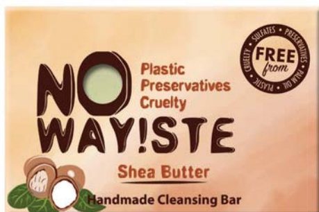
NW10 cleansing bar shea butter