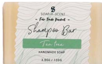
SNS124 solid shampoo 100g tea tree