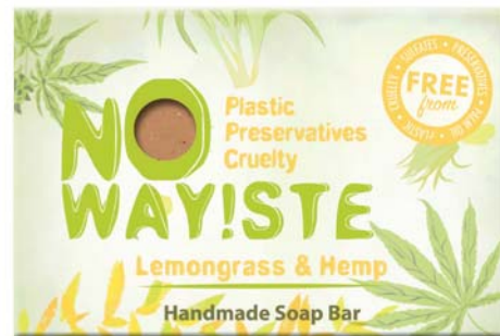
NW03 soap lemongrass & hemp