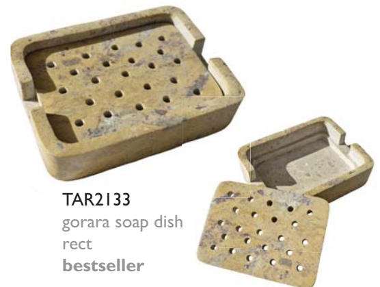
TAR2133 gorara soap dish rect bestseller