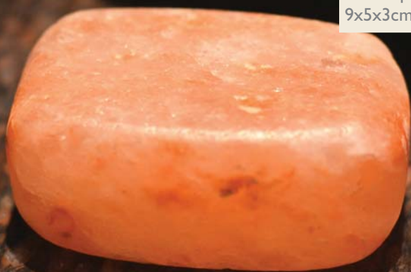
PAK015 salt soap 9x5x3cm