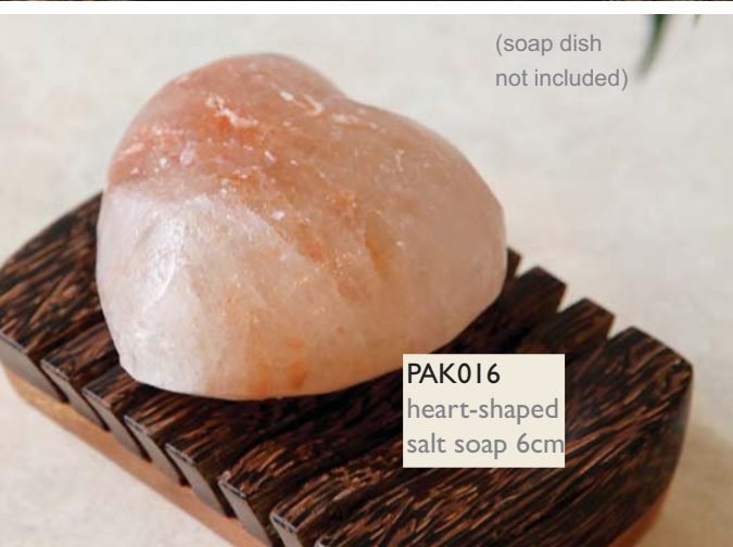
PAK016 heart-shaped salt soap 6cm