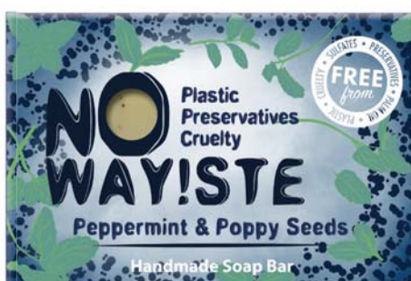
NW05 soap peppermint & poppy seeds