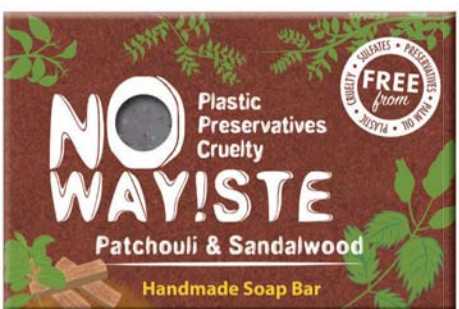
NW07 soap patchouli & sandalwood