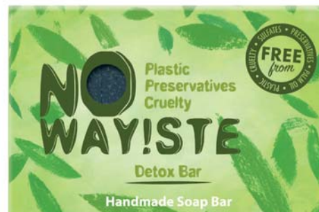
NW13 detox bar