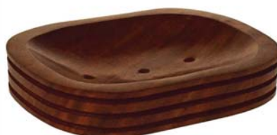
ASH2295 soap dish shesham wood