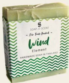
SNS152 soap 100g wind