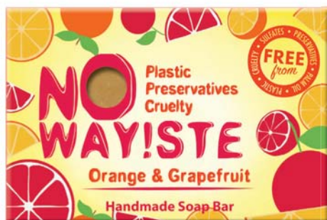
NW04 soap orange & grapefruit