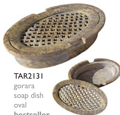
TAR2131 gorara soap dish oval bestseller