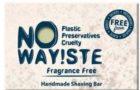
NW19 shaving bar fragrance free