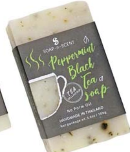
SNS170 'peppermint tea'