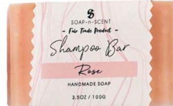
SNS126 solid shampoo 100g rose