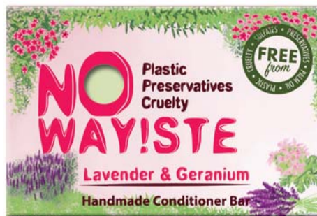
NW21 conditioner lavender & geranium