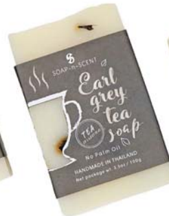
SNS172 'earl grey tea'