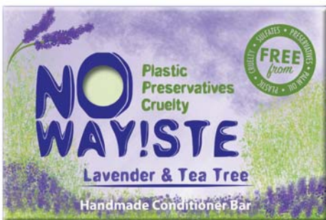
NW20 conditioner lavender & tea tree