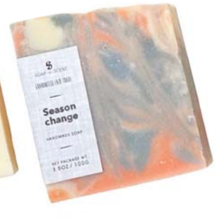
SNS176 season change