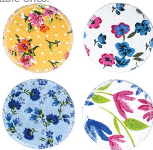
TAR2181 set of 4 floral

A great eco and sustainable gift, made from recycled saris, wash and re-use instead of using disposable ones.