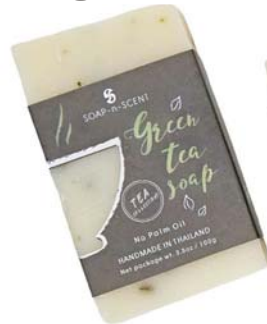
SNS171 'green tea'