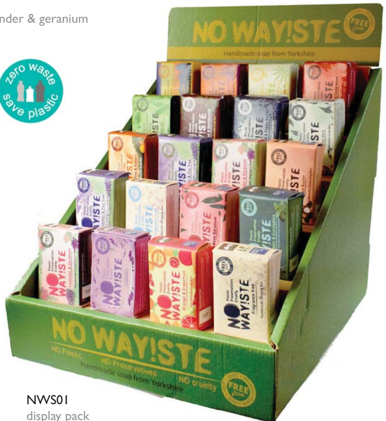
NWS01 display pack 'No Way!ste' 6e x 20 codes