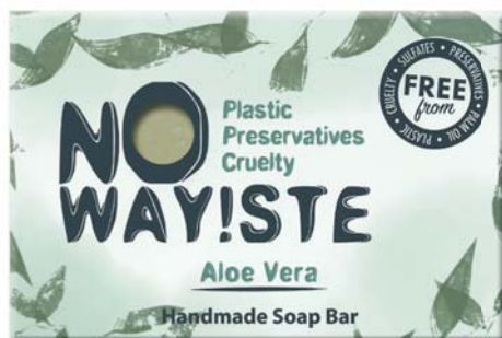
NW01 soap aloe vera

NO WAY!STE Plastic Preservatives cruelty