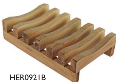
HER0921B soap dish bamboo 7 strip