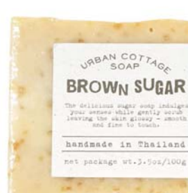
SNS179 'urban cottage' brown sugar