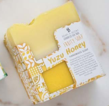
SNS183 'fruity' yuzu honey