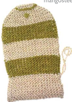
PROK036 hemp body mitt 'fish'