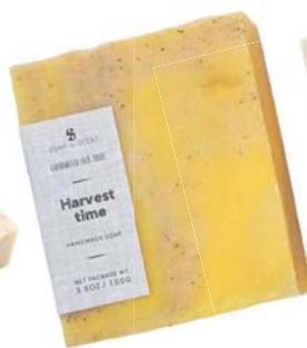
SNS173 harvest time