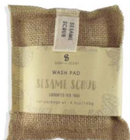
SNS161 sesame scrub

Handmade in Thailand, these natural jute soap infused wash pads help exfoliate and cleanse your body at the same time. They come in 6 different scents and once the soap runs out, you can reuse them by inserting another soap of choice.