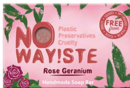
NW08 soap rose geranium