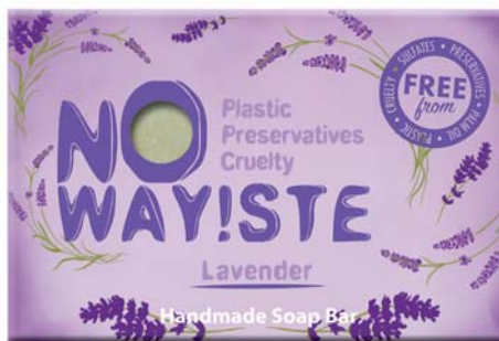
NW02 soap lavender