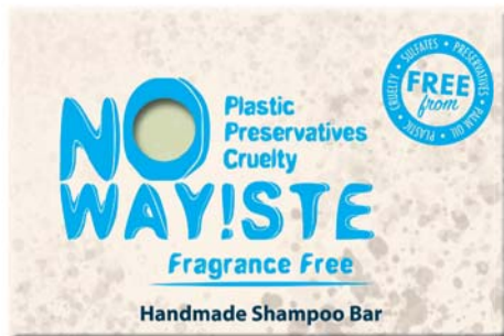
NW17 shampoo bar fragrance free