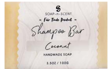
SNS122 solid shampoo 100g coconut