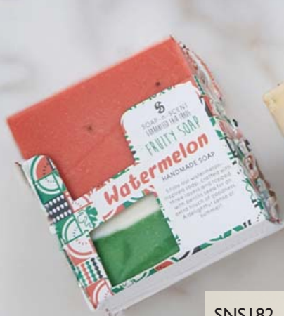
SNS182 'fruity' watermelon