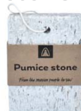
WD2110 mayan beauty pumice stone box of 16 bestseller

Pumice stone has been used for centuries by the Mayan people to clean arms as well as feet. It's a volcanic rock and large quantities are found in Guatemala's mountain ranges.