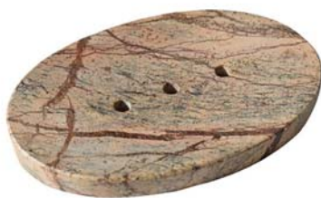
TAR2130 gorara soap dish oval