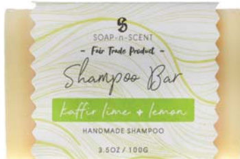
SNS121 solid shampoo 100g kaffir lime & lemon