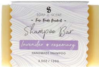
SNS120 solid shampoo 100g lavender & rosemary