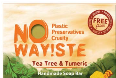
NW06 soap tea tree & turmeric