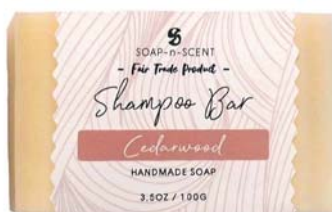
SNS123 solid shampoo 100g cedarwood