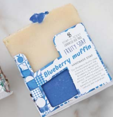
SNS184 'fruity' blueberry muffin