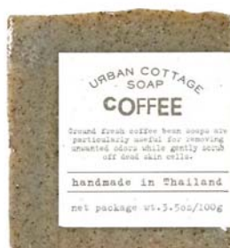
SNS178 'urban cottage' 100g coffee