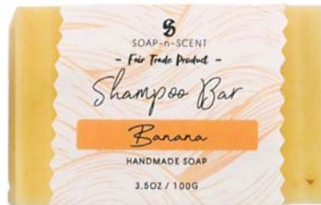
SNS125 solid shampoo 100g banana