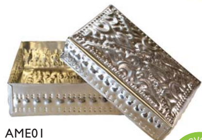
AME01 decorated aluminium box 9x6x3cm