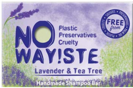
NW14 shampoo bar lavender & tea tree