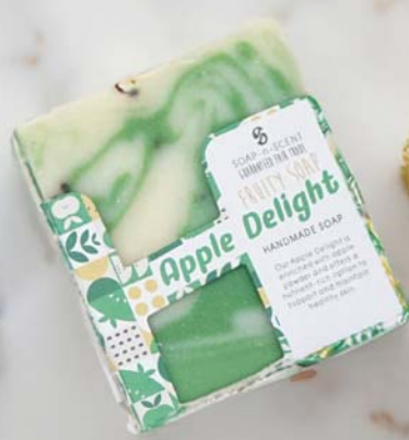
SNS181 'fruity' apple delight