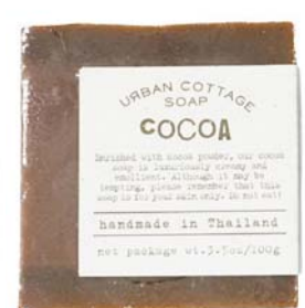
SNS180 'urban cottage' cocoa