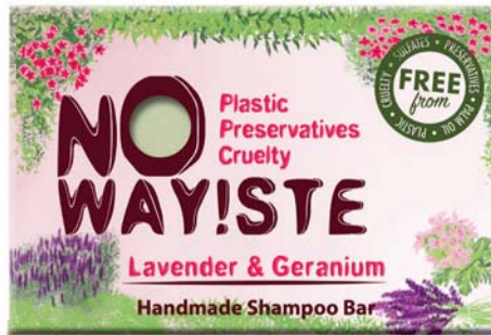
NW15 shampoo bar lavender & geranium