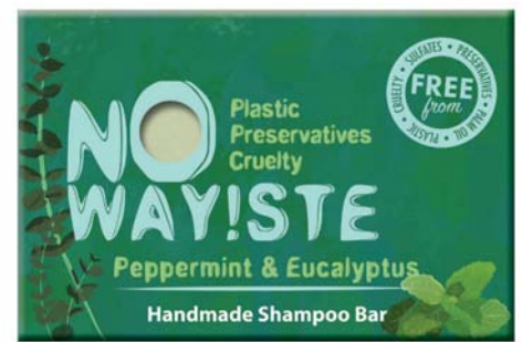
NW16 shampoo bar peppermint & eucalyptus