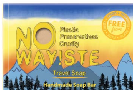
NW12 soap travel bar