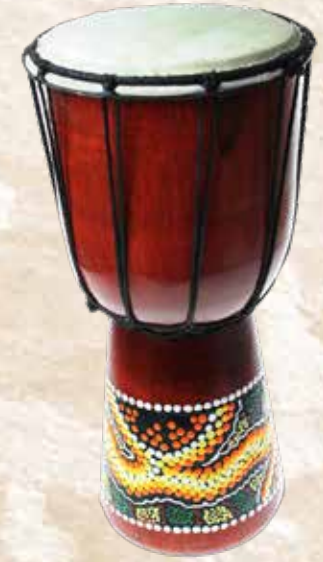
RZ1802 jembe drum 30cm