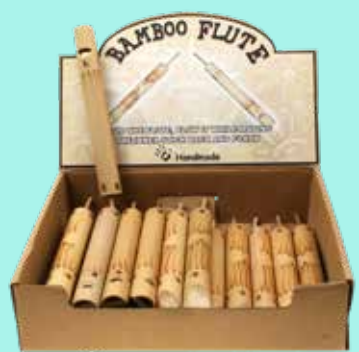
S1701 bamboo swanee whistle box of 18