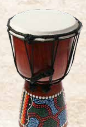
RZ1801 mini jembe drum 20cm