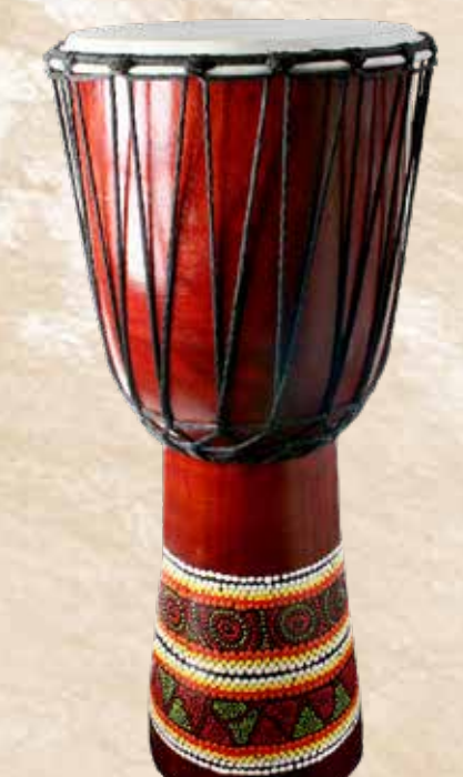
RZ1804 jembe drum 50cm