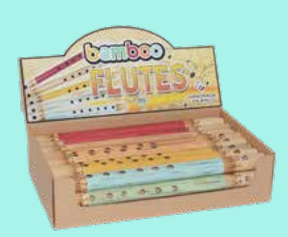
S0078 painted bamboo flute box of 24