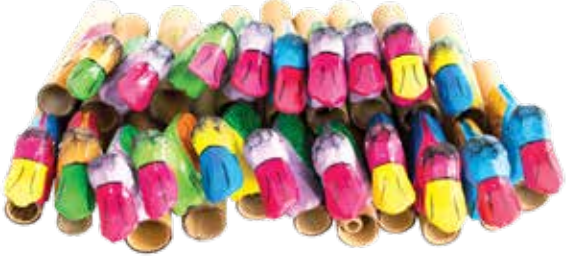
RZ1823BOX duck quacker, asst. bright colours set of 50