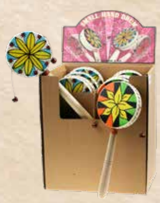
S1705 small hand drums box of 12