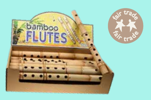
S1700 bamboo flutes box of 24