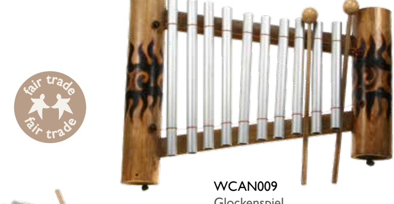
Glockenspiel 10 tube, non-western tuning

Many of these instruments feature the vibrant dot design art that is so well known from the aboriginal cultures of Australia.