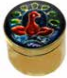
SONG060D 4g mini-jar neroli