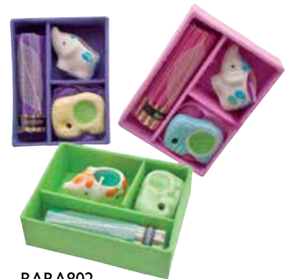
BARA802 incense with elephant candle & elephant incense holder 3 asst cols