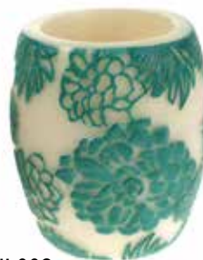
NL008 10cm hurricane