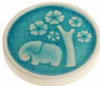
CCUT018 elephants & tree 8cm dia