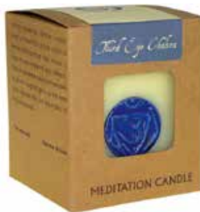
SONG007 third eye bestseller