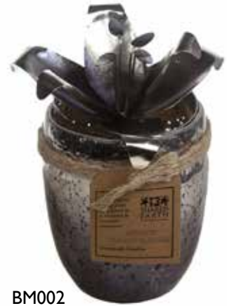
BM002 Japan cherry blossom silver lily lid