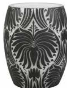
NL073 10cm hurricane