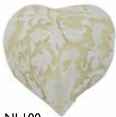
NL100 candle heart wh + ivory