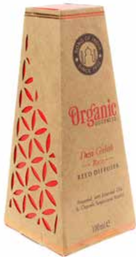
SONG206 organic reed sticks diffuser rose