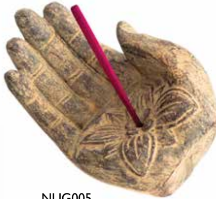
NUG005 sandstone & resin 15cm bestseller