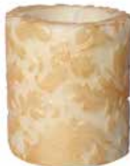
NL031 7.5cm recessed

colours: white + gold scent: wild honey & cream