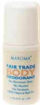
MAR007 body deodorant 50ml

This deodorant leaves you odour free for many hours. Its non-sticky, non-greasy formula dries quickly without staining your clothes. It contains no alcohol, no aluminum salts or parabens.