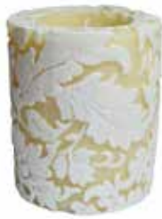
NL021 7.5cm recessed

colours: white & ivory scent: peony & sweet pea