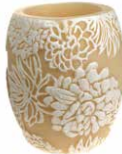
NL003 10cm hurricane