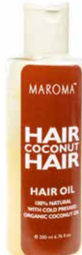
MAR019 coconut hair oil 200ml