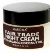
MAR016 night face cream coconut 50g