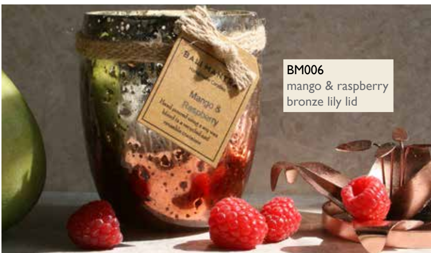
BM006 mango & raspberry bronze lily lid