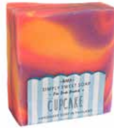
SNS131 soap 100g cupcake