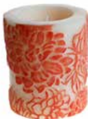
NL011 7.5cm recessed

colours: white + ombre scent: orange freesia