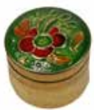
SONG060C 4g mini-jar buddha delight