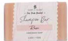
SNS126 solid shampoo 100g rose