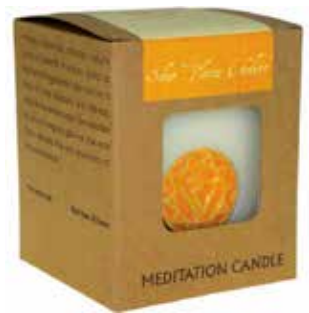
SONG004 solar plexus