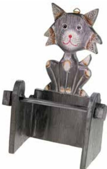
TS01 toilet roll holder grey cat