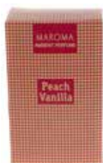
MARAP11 peach vanilla