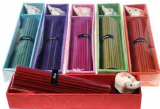
BWIS1803 incense elephant holder 17 x 4cm 6 assorted colours