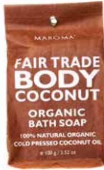
MAR017 coconut bath soap 100g