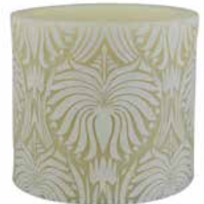
NL064 10cm recessed

colours: white + gold scent: moroccan rose