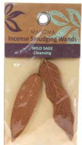
MAR069 incense smudging wands wild sage, cleansing