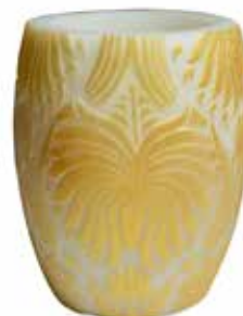
NL068 10cm hurricane