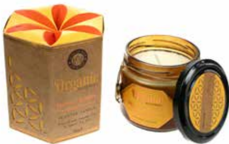
SONG202 organic candle sandalwood