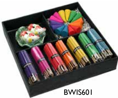
BWIS601 incense gift set bestseller