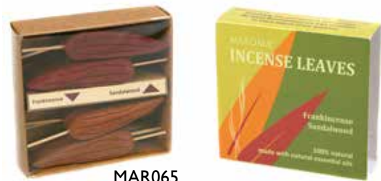
MAR065 incense leaves frankincense & sandalwood