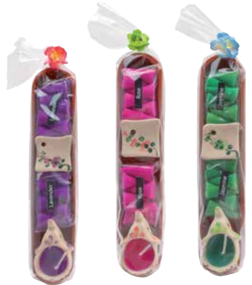
BARA806 3 asst cols bestseller

Our Fair Trade incense and candle sets from Thailand are made by women in a workshop where 'people not profit' is the motto. Staff are paid more than the minimum wage and the owner, a woman herself, always tries to help them out if they have a problem in their personal lives.