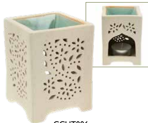
CCUT006 9.5cm height