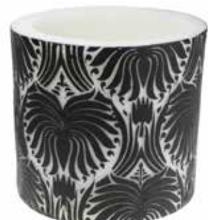
NL074 10cm recessed

NLPACK04 starter pack 27 lotus flower candles