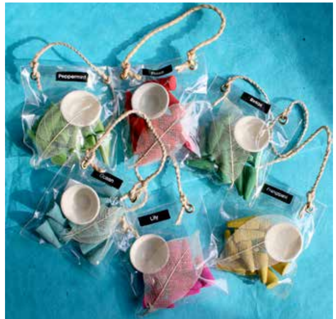
BAWA010 incense cones 10 in bag with leaf 6 assorted: ocean, lily, rose, peppermint, relax, frangipani