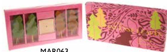
MAR063 gift box incense leaves + holder pine, orange, cinnamon