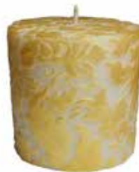
NL032 7.5cm flat