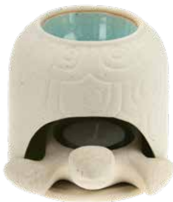
CCUT002 10cm height