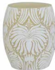
NL063 10cm hurricane