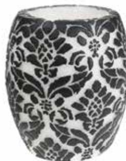
NL048 10cm hurricane