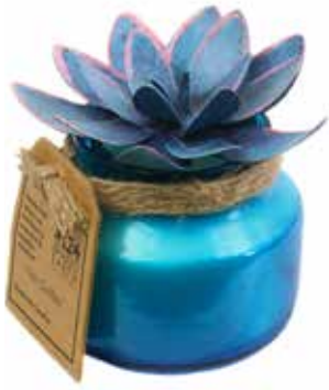
BM022 glass jar, 5.5cm blue lotus lid scent: irish coffee