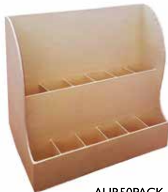
AUR50PACK pre-filled display with 144 packs of incense