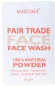
MAR005 face wash powder natural 10g

All soaps and beauty products from Maroma, are cruelty free. All body scrub, face, and hair wash powders and oils are made from 100% natural ingredients.