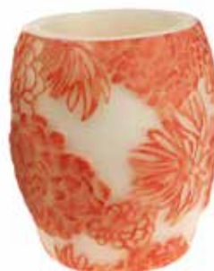
NL013 10cm hurricane