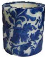
NL026 7.5cm recessed

colours: white + tatoon blue scent: rosehip & patchouli