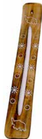
ASH169A elephant bestseller