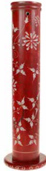
SONG242 incense tower red leaves