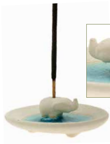
CCUT010 8cm dia