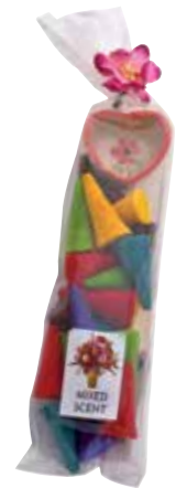
BWIC833 incense cones with holder