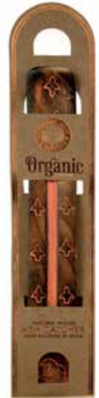
SONG238 orange arrows