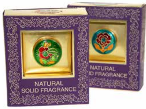
SONG244 4g solid perfume in brass jar & gift box. assorted scents bestseller