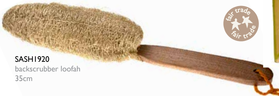
SASH120 backscrubber loofah 35cm