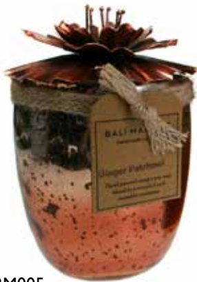
BM005 ginger patchouli bronze hibiscus lid bestseller