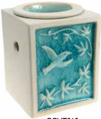
CCUT015 bird 9.5cm height