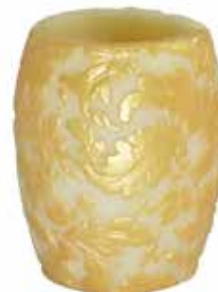
NL033 10cm hurricane