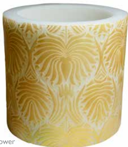
NL070 lotus flower wh + gold 15cm lantern with t-lite stand