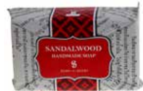
SNS001 sandalwood 100g