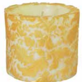
NL034 10cm recessed

NLPACK02 starter pack 27 damask leaf candles