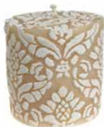
NL042 7.5cm flat