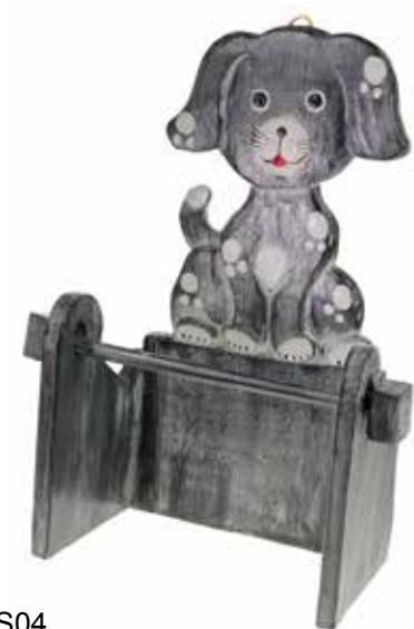
TS04 toilet roll holder grey dog