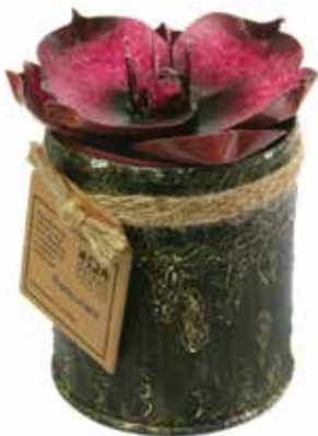
BM013 distressed jar, pink peony lid scent: red currant