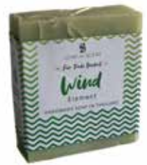
SNS152 soap 100g wind