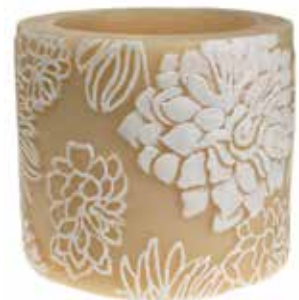
NL004 10cm recessed

colours: white + aqua scent: wild fig & pomegranate