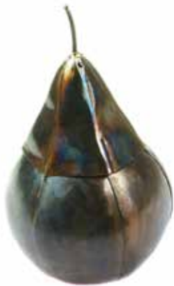
BM017 oil slick effect pear, scent: ginger patchouli

The metal containers for these candles are made from recycled materials