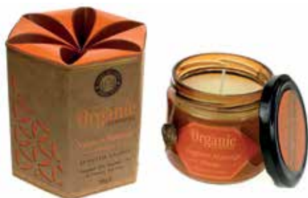
SONG205 organic candle narangi orange