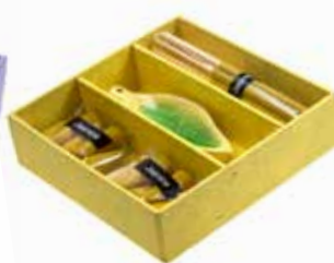
BARA600 incense gift set 6 asst