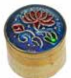
SONG060B 4g mini-jar aphrodesia