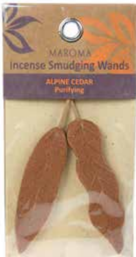
MAR066 incense smudging wands alpine cedar, purifying

Smudging is the common name given to the Sacred Smoke Bowl Blessing ritual practiced by Native Americans. The ritual seeks to cleanse negative energies in a space or a body by the burning of herbs and, thereby, to restore a state of harmony, peace and balance.