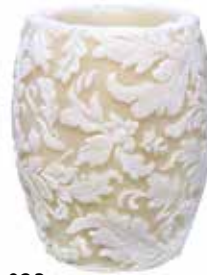
NL023 10cm hurricane