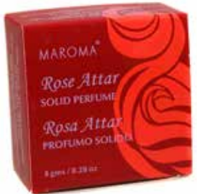
MARSP01 rose attar, 8g