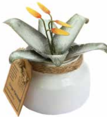
BM024 glass jar, 5.5cm white & gold water lily lid, scent: ginger patchouli