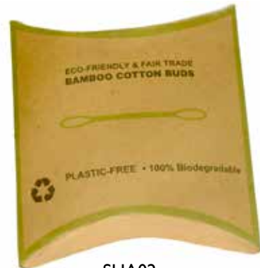
SHA02 bamboo cotton buds pack of 100