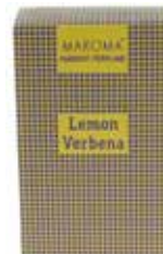
MARAP06 lemon verbena