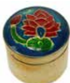
SONG060E 4g mini-jar patchouli