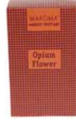
MARAP08 opium flower