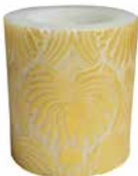
NL066 7.5cm recessed

colours: white + gold scent: moroccan rose