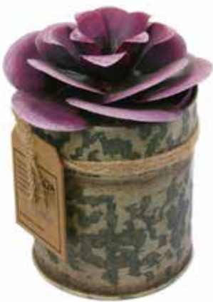
BM010 distressed jar, purple camelia lid scent: white sage

Soy wax, cotton wicks, no phthalates or parabens, or sulphates. Not tested on animals. Recycled & reusable containers.