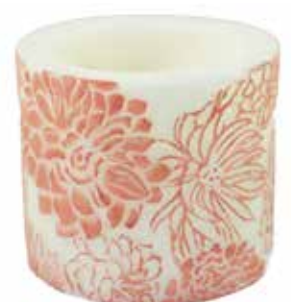
NL014 10cm recessed

NLPACK01 starter pack 27 Japanese Chrysanthemum candles