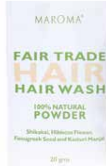
MAR020 hair wash 20g