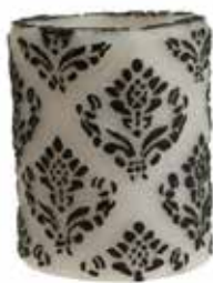
NL046 7.5cm recessed

colours: white + black scent: coconut & lime