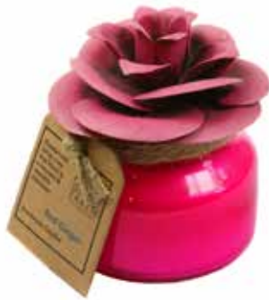
BM023 glass jar, 5.5cm pink camelia lid scent: red ginger