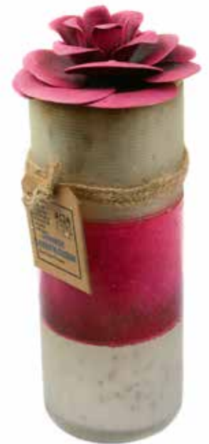
BM018 pink camelia lid, 15cm scent: japanese cherry blossom