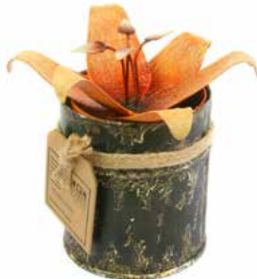
BM014 distressed jar, orange lily lid scent: kaffir lime