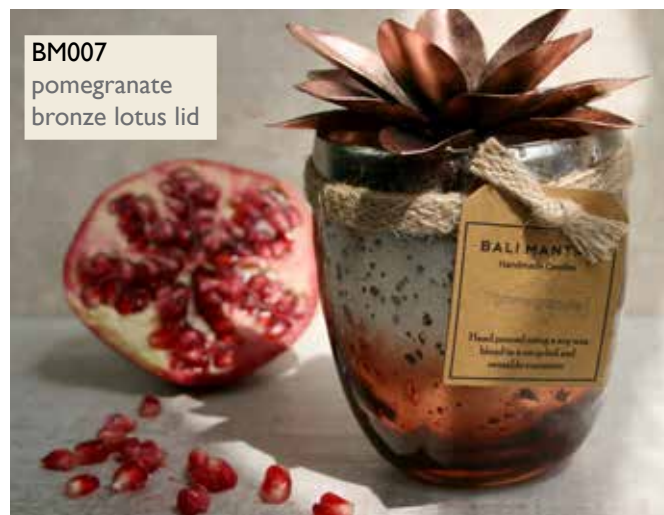
BM007 pomegranate bronze lotus lid