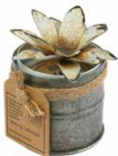
BM026 distressed jar, 6.5cm white lotus lid scent: woody tobacco bestseller