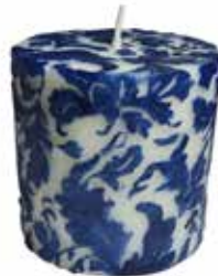
NL027 7.5cm flat