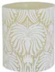
NL061 7.5cm recessed

colours: white + ivory scent: rosehip & patchouli