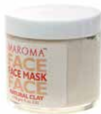
MAR003 face mask. natural clay with citrus, peppermint, ylang ylang and rosemary oil. 100g