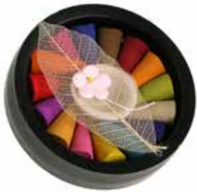
BWIS1802 mixed incense cones in round box bestseller