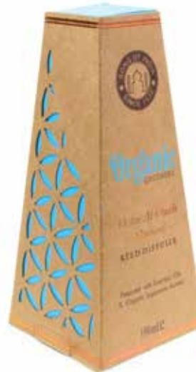
SONG211 organic reed sticks diffuser agarwood