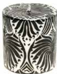
NL072 7.5cm flat