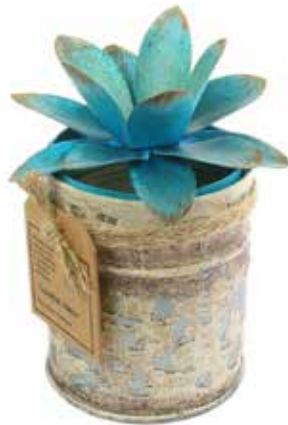
BM012 distressed jar, blue lotus lid scent: coastal waters