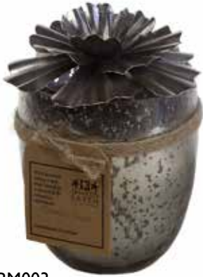
BM003 coastal water silver hibiscus lid