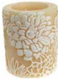
NL001 7.5cm recessed

colours: white + ivory scent: coconut & lime