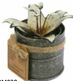
BM028 distressed jar, 6.5cm white water lily lid scent: red currant