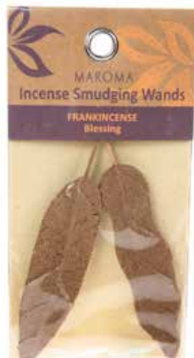
MAR067 incense smudging wands frankincense, blessing