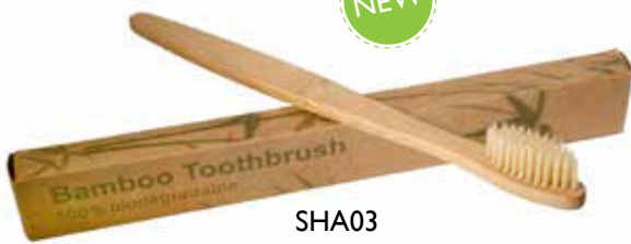
SHA03 bamboo toothbrush