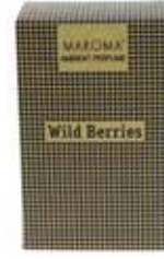
MARAP15 wild berries