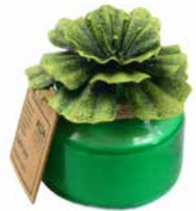
BM025 glass jar, 5.5cm green hibiscus lid, scent: kaffir lime

The metal containers for these candles are made from recycled materials