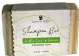
SNS120 solid shampoo 100g lavender & rosemary