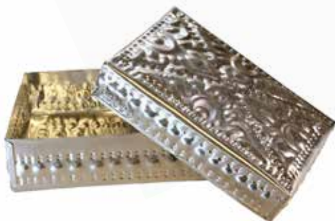
AME01 decorated aluminium box 9x6x3cm