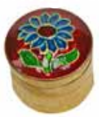
SONG060G 4g mini-jar rose