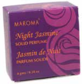
MARSP08 night jasmine, 8g