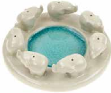
CCUT012 elephants, 10cm dia