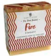
SNS151 soap 100g fire