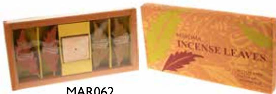
MAR062 gift box incense leaves + holder patchouli & cedarwood