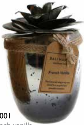
BM001 French vanilla silver camellia lid