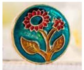
SONG060 perfume 4g in brass jar (set of 42) TOP SELLER