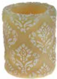
NL041 7.5cm recessed

colours: white + ivory scent: amber & ginger rose