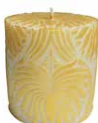
NL067 7.5cm flat