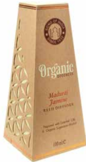
SONG207 organic reed sticks diffuser jasmine