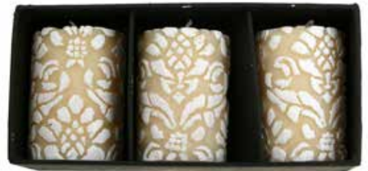
NL105 votive set in box wh + ivory

45 candles in assorted colourways and floral designs 15 x 7.5cm recessed 10 x 7.5cm flat 10 x 10cm hurricane 10 x 10cm recessed