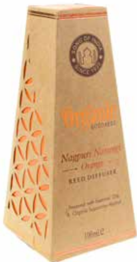
SONG209 organic reed sticks diffuser narangi orange