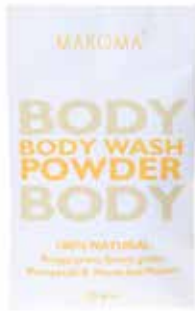
MAR006 body wash powder 20g