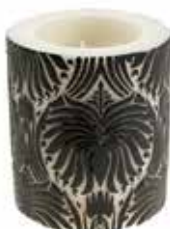
NL071 7.5cm recessed

colours: white + black scent: peony & sweet pea