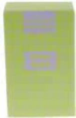
MARAP02 green apple