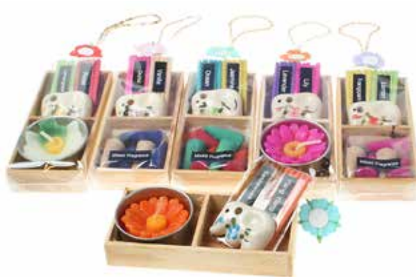
BARA1800 incense elephant sets with cones or t-lite, 6 assorted