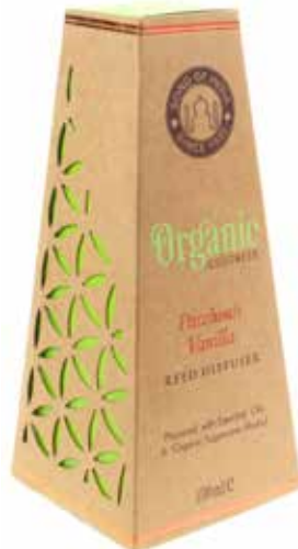
SONG210 organic reed sticks diffuser patchouli vanilla