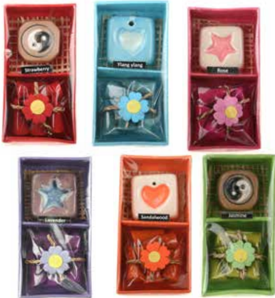
BARA601 incense cone set 6 asst