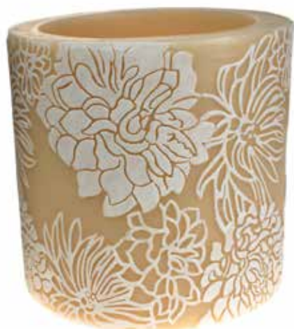
NL005 japanese chrysanthemum wh + ivory 15cm lantern with t-lite stand

Looking for dramatic lighting for dining room tables without replacing candles every day? These hollow wax candles are designed to accommodate a t-lite, giving the same warm candlelit glow night after night. The candle comes with a t-lite stand.