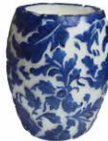
NL028 10cm hurricane