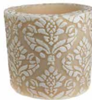
NL044 10cm recessed

colours: white + black scent: coconut & lime