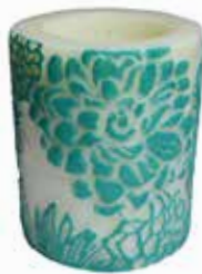
NL006 7.5cm recessed

colours: white + aqua scent: wild fig & pomegranate