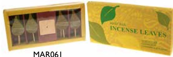
MAR061 gift box incense leaves + holder lemongrass, lavender, rosemary