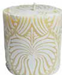
NL062 7.5cm flat