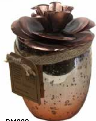
BM008 peach & grapefruit bronze camellia lid