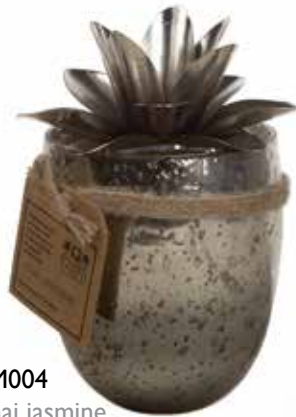
BM004 Thai jasmine silver lotus lid