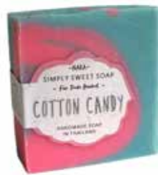
SNS130 soap 100g cotton candy