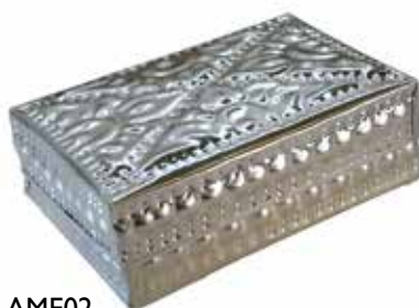
AME02 decorated aluminium box 7x8x3cm