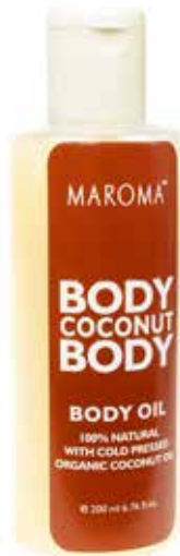
MAR018 coconut body oil 200ml