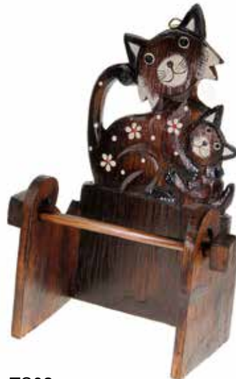
TS02 toilet roll holder brown cat & kitten