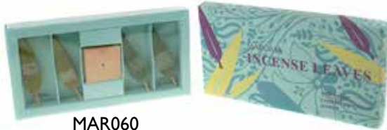
MAR060 gift box incense leaves + holder cypress, eucalyptus, juniper