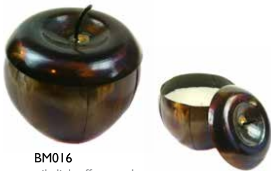
BM016 oil slick effect apple, scent: ginger patchouli