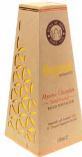
SONG208 organic reed sticks diffuser sandalwood