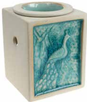
CCUT016 peacock 9.5cm height