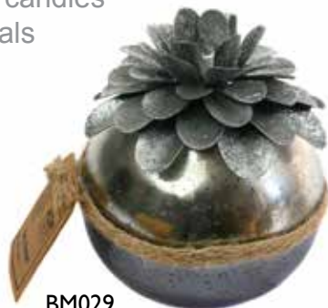
BM029 silver colour sphere, 5.5cm chrysanthemum lid scent: berry sorbet bestseller