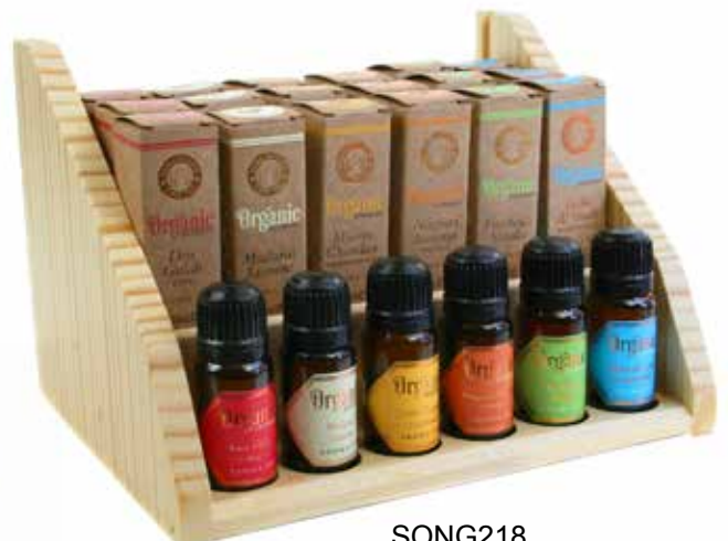
SONG218 starter pack, aroma oil x 24 with display stand

This product is a room fragrance and is not to be ingested or put on the skin. There are approx. 200 drops in a 10ml bottle. Add 3-4 drops to water in an aroma burner to fill your room with subtle fragrance.