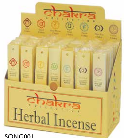
SONG001 chakra incense wands display (set 140) 7 different fragrances