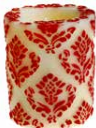
NL051 7.5cm recessed