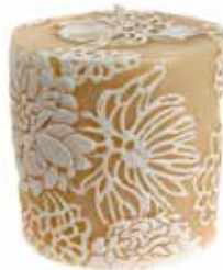
NL002 7.5cm flat