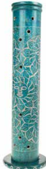
SONG241 incense tower turquoise sun