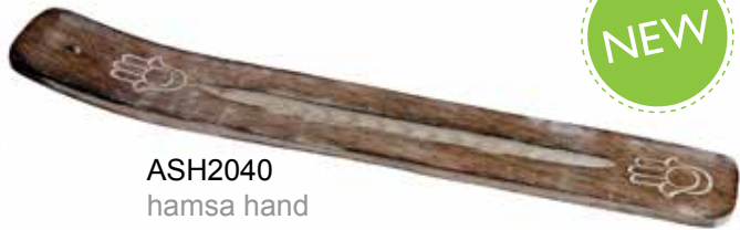
ASH2040 hamsa hand