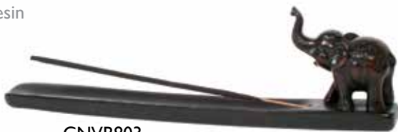
CNVB803 resin bestseller