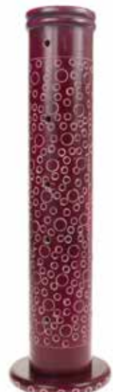
SONG243 incense tower purple bubbles