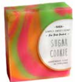
SNS132 soap 100g sugar cookie