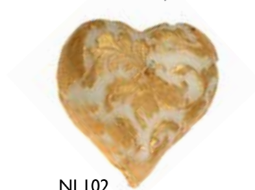
NL102 candle heart wh + gold