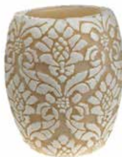
NL043 10cm hurricane