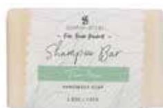
SNS124 solid shampoo 100g tea tree