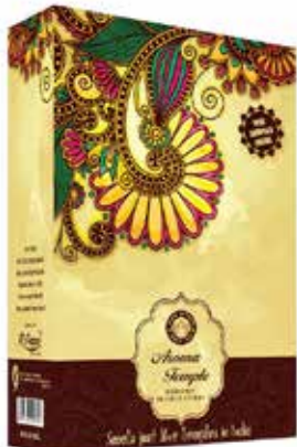
SONG016 incense: aroma temple (set of 12)