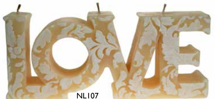
NL107 candle love wh + ivory