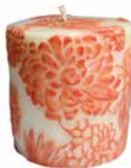
NL012 7.5cm flat