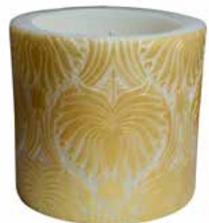
NL069 10cm recessed