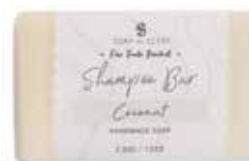
SNS122 solid shampoo 100g coconut