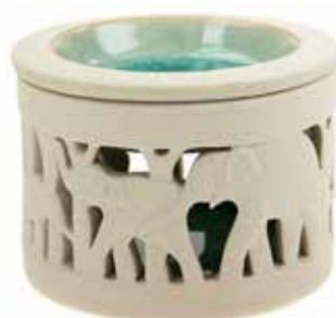
CCUT009 7.5cm height