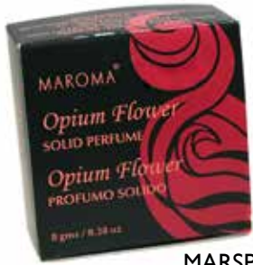
MARSP03 opium flower, 8g

Maroma is owned by a trust set up to provide employment opportunities to women in the villages around Auroville in Tamil Nadu.