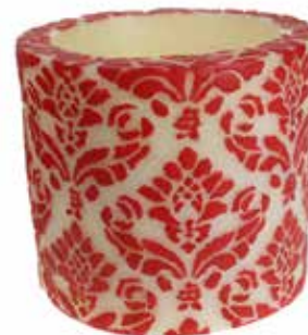
NL054 10cm recessed

NLPACK03 starter pack 27 pineapple damask candles