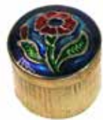
SONG060F 4g mini-jar jasmine