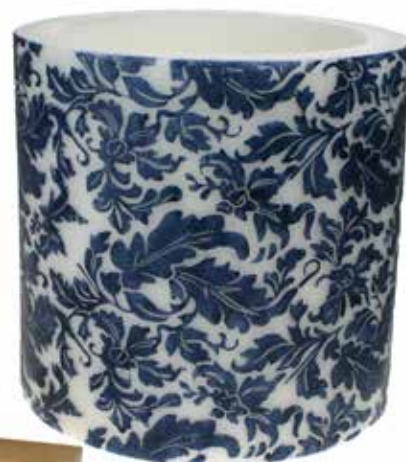
NL030 damask leaf wh + tattoo blue 15cm lantern with t-lite stand