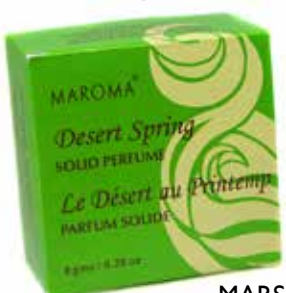
MARSP07 desert spring, 8g