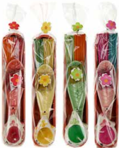
BASB600 candle & incense asst cols