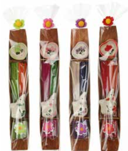
BASB601 boat tray incense, asst cols