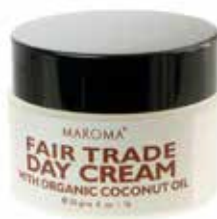
MAR015 day face cream coconut 50g