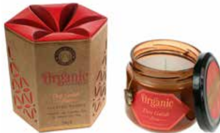
SONG200 organic candle rose

The wicks of these candles are 100% cotton. Burn time: 60 hours. These candles produce negligible amounts of soot and release no known carcinogens into the air.