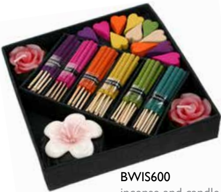
BWIS600 incense and candle set bestseller

These high quality, well-priced gift sets come from the historic city of Chiang Mai in northern Thailand.