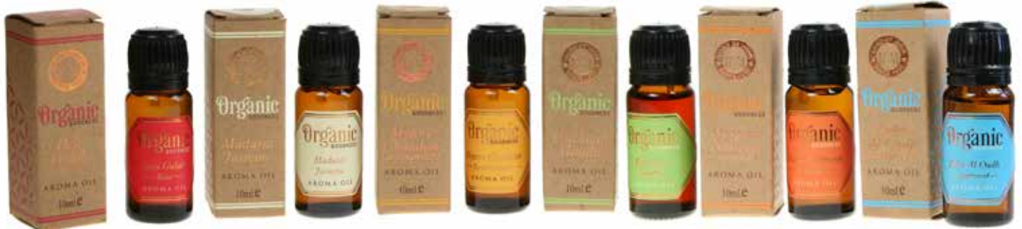
SONG212 aroma oil desi gulab rose