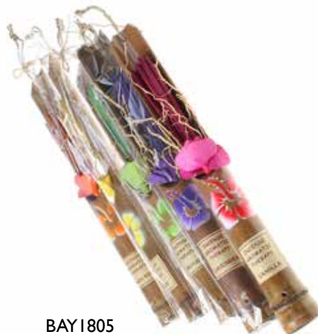
BAY1805 incense in bamboo holders set of 5