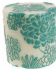
NL007 7.5cm flat