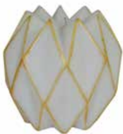
NL103 candle - origami motif wh + gold