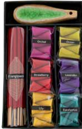
BWIS909 incense gift set bestseller