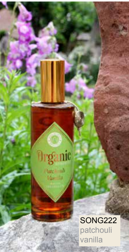
SONG222 patchouli vanilla