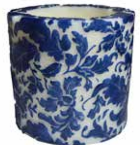
NL029 10cm recessed