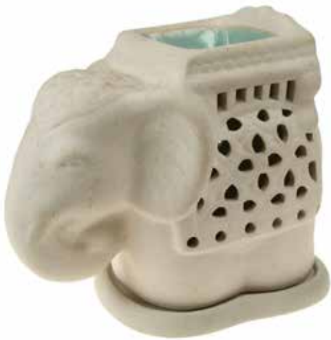
CCUT017 elephant 11cm height