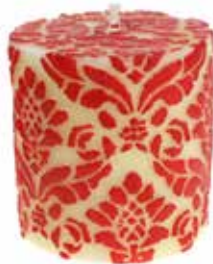
NL052 7.5cm flat