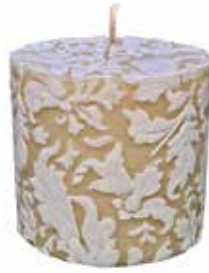
NL022 7.5cm flat