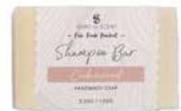
SNS123 solid shampoo 100g cedarwood