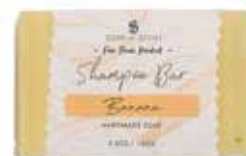
SNS125 solid shampoo 100g banana