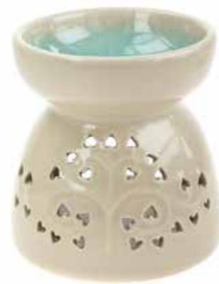
CCUT001 9cm height