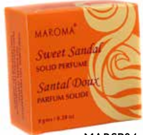
MARSP04 sweet sandal, 8g