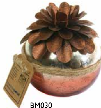
BM030 copper colour sphere, 5.5cm chrysanthemum lid scent: peach & grapefruit