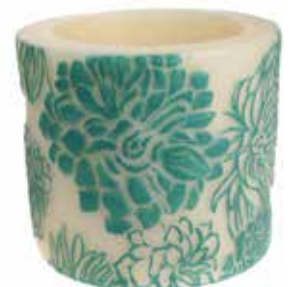
NL009 10cm recessed

colours: white + ombre scent: orange freesia