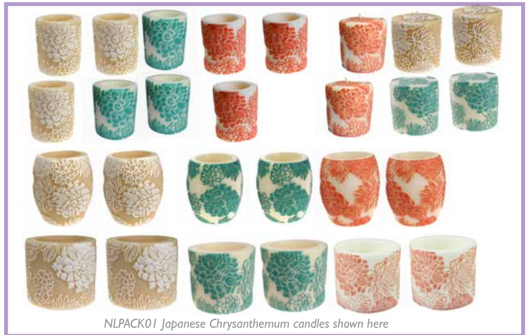
NLPACK01 Japanese Chrysanthemum candles shown here

27 candles pineapple damask 3x7.5cm recessed, 2 x7.5cm flat,, 2 x10cm hurricane 2x10cm recessed = 9 candles x 3 colourways = candles total