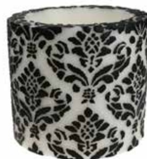
NL049 10cm recessed