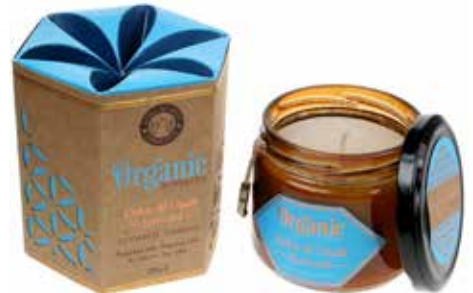
SONG204 organic candle agarwood