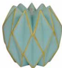
NL104 candle - origami motif aqua + gold