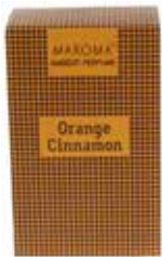
MARAP09 orange cinnamon