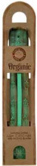
SONG232 green hands