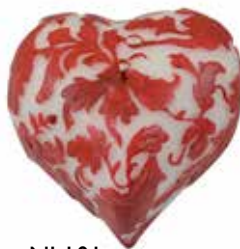
NL101 candle heart wh + red