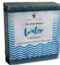
SNS153 soap 100g water