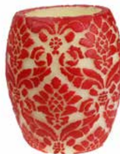
NL053 10cm hurricane