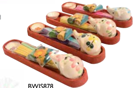
BWIS878 asst cols bestseller