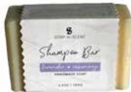
SNS121 solid shampoo 100g kaffir lime & lemon