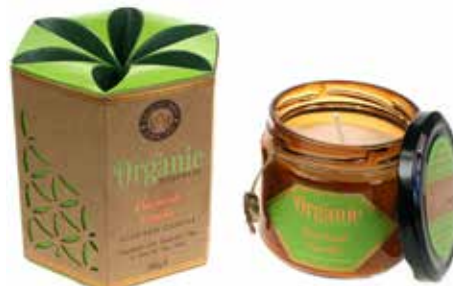
SONG203 organic candle patchouli vanilla