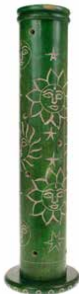
SONG240 incense tower green sun