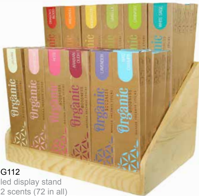
SONG112 prefilled display stand 6 x 12 scents (72 in all)