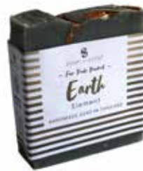
SNS150 soap 100g earth