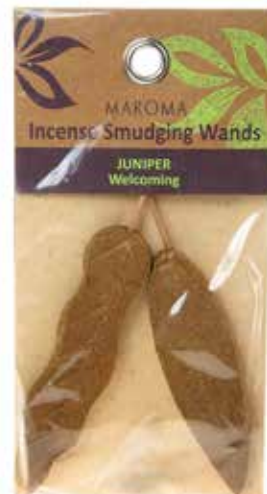
MAR068 incense smudging wands juniper, welcoming