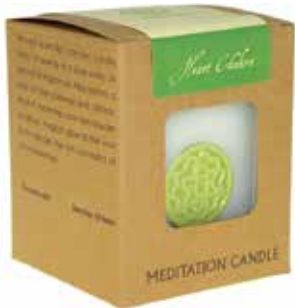
SONG005 heart bestseller