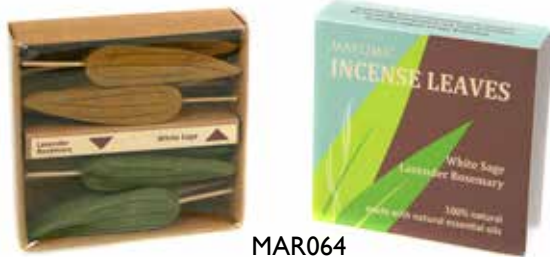
MAR064 incense leaves white sage, lavender, rosemary