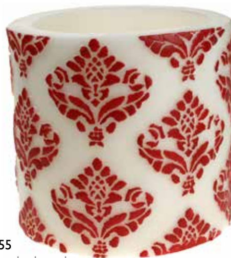
NL055 pineapple damask wh + red 15cm lantern with t-lite stand