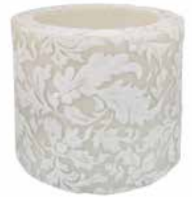
NL024 10cm recessed

colours: white + tatoon blue scent: rosehip & patchouli