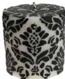
NL047 7.5cm flat