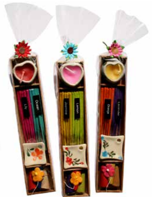
BAWA001 wooden tray with incense sticks, cones, candles and holder 3.5 x 17 cm 3 asst