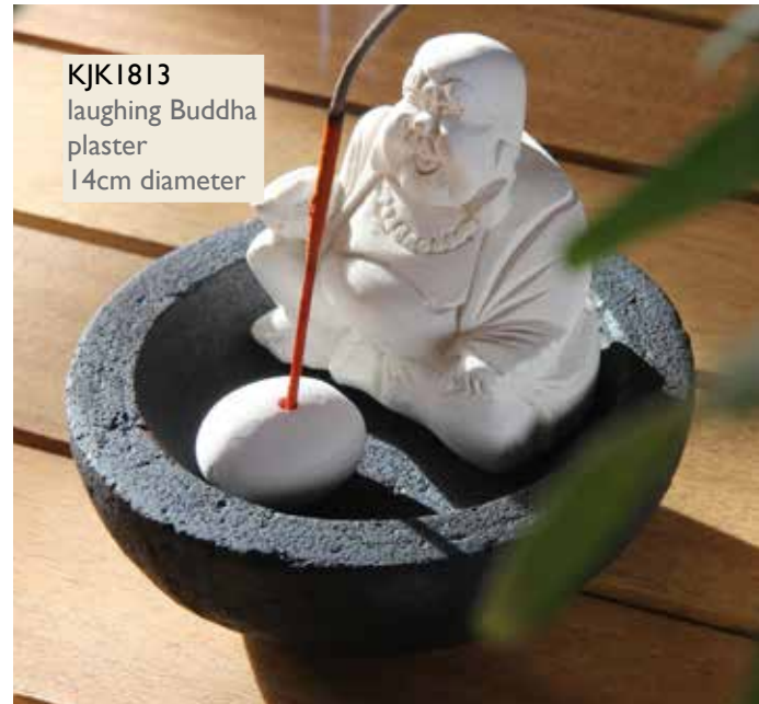
KJK1813 laughing Buddha plaster 14cm diameter