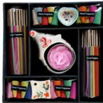
BAWA009 incense set, elephant, mixed 16 x 16 cm bestseller