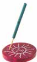
TAR18700 sun pink