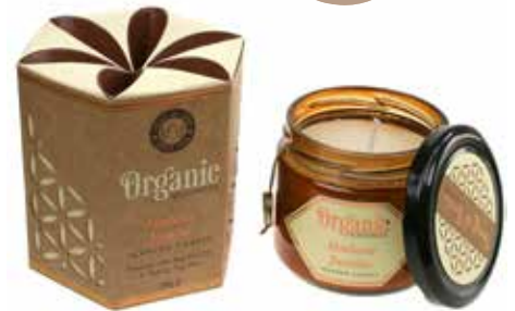
SONG201 organic candle jasmine