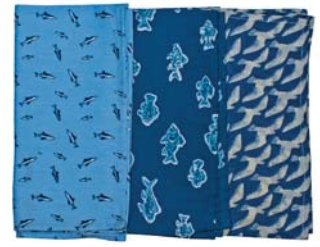
TAR2174 set of 3 wildlife