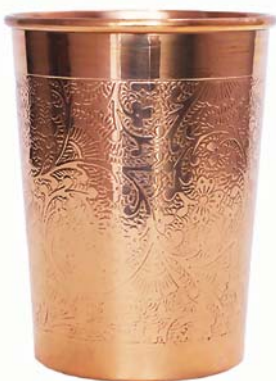
COP07 copper glass engraved 300ml