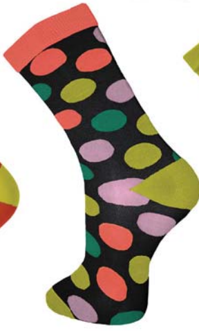
ASP056 LAR ASP056 MED polka dots