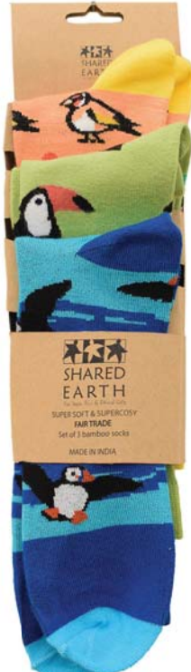
ASPA02LAR ASPA02MED goldfinches, toucans, puffins