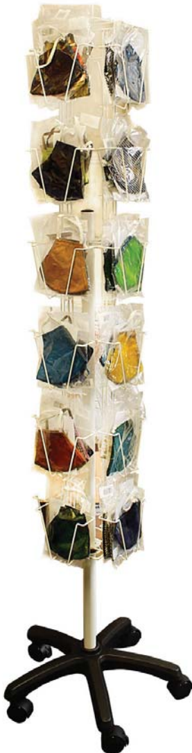
MASK06-6ASPIN24 24 pocket floor spinner MASK06-6A asst cols & sizes x 300 70 inches ht