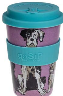
RH019 walkies bestseller