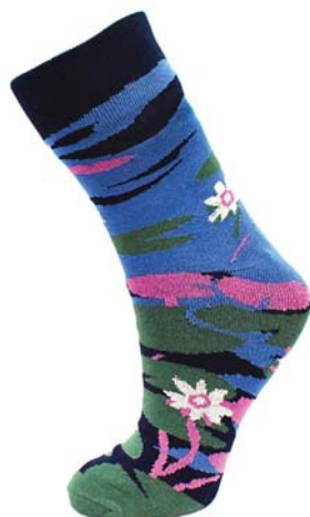
ASP2801LAR ASP2801MED water lillies