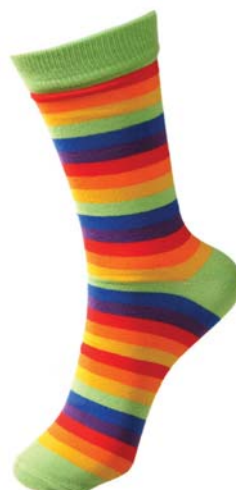
ASP18720 MED ASP18720 LAR rainbow