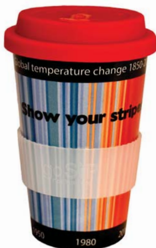
RH053 show your stripes

Show your stripes! These stripes, which show a colour for the average temperature for each year (blue for cool, red for warm) were invented by climate scientist Ed Hawkins. Starting in 1850, they show mainly dark blue till about 1920, then gradually lighter blue until about 1980, and then suddenly, in the space of just 20-30 years, light red, dark red and almost black – this last decade has been the warmest on record. It's a visual representation of global warming which it's hard to ignore.