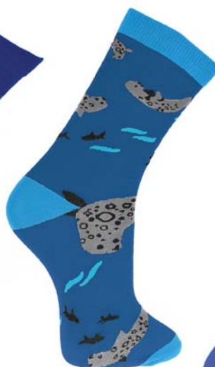
ASP028 LAR ASP028 MED seals