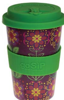
RH012 folk florals maroon