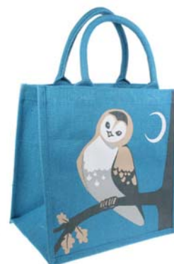
EA1874 owl & moon