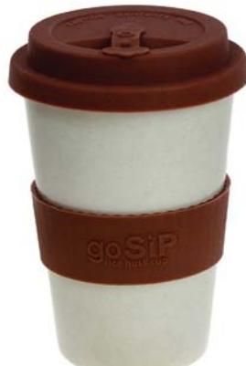
RH033 vanilla mocha bestseller