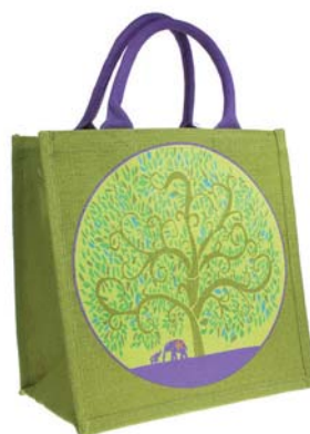
EA1901 tree of life & elephants