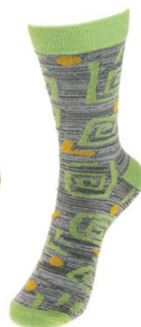
ASP18724 MED ASP18724 LAR square swirls