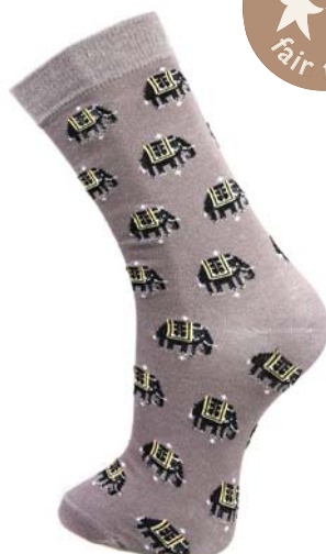
ASP18713 MED ASP18713 LAR elephant, grey, black & yellow