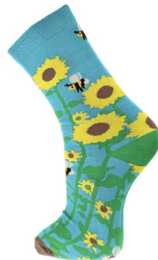
ASP2001 LAR ASP2001 MED sunflowers & bees