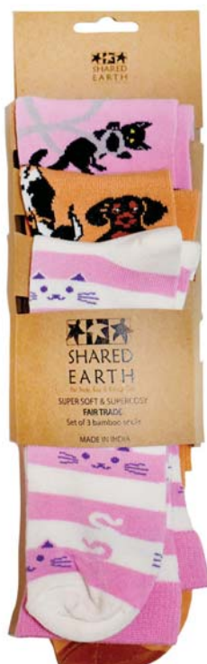
ASPA07LAR ASPA07MED cats & dogs