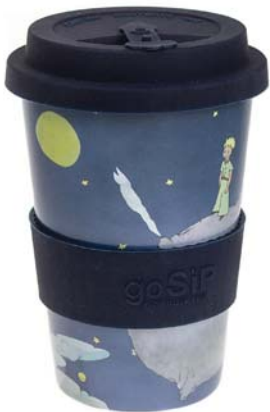
RH021 Le Petit Prince bestseller