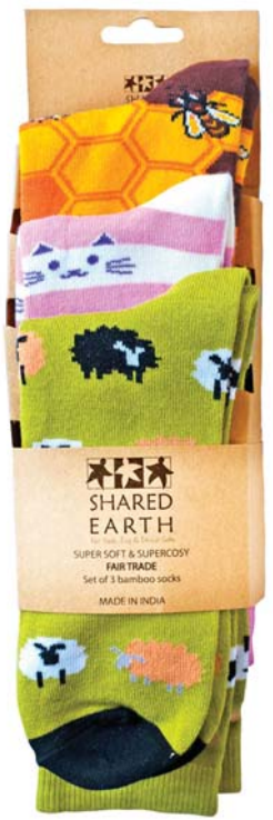
ASPA10LAR ASPA10MED bees, cats, sheep