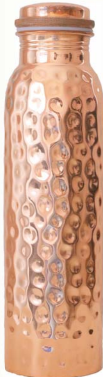
COP05 copper water bottle hammered 900ml