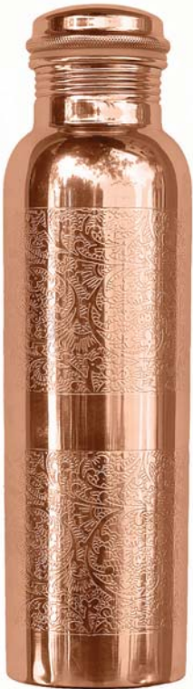
COP04 copper water bottle engraved 900ml