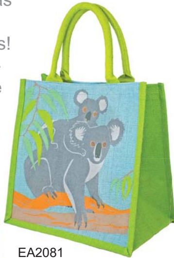
EA2081 koala and baby