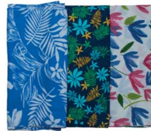
TAR2171 set of 3 floral & fruits