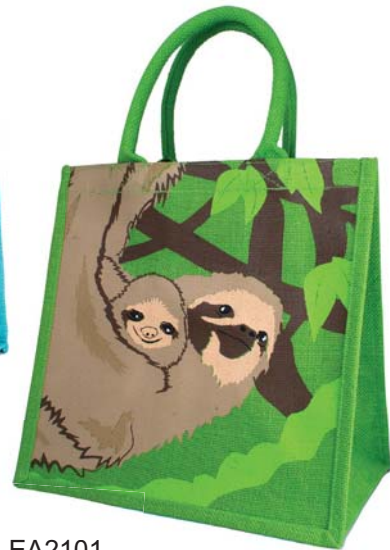
EA2101 sloth with baby