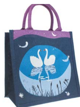
EA1902 moon swans