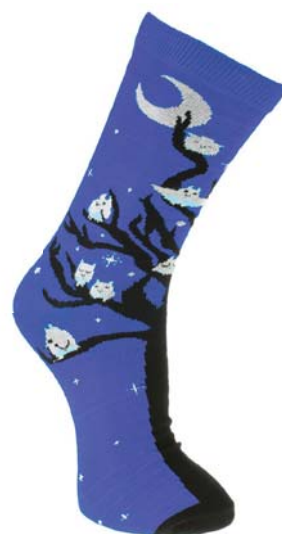
ASP030 LAR ASP030 MED owls