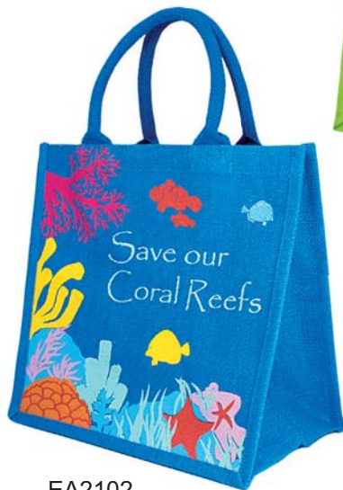
EA2102 save our coral reefs