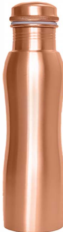
COP06 copper water bottle curve matt 900ml