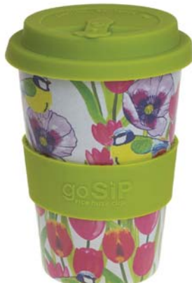
RH004 bluetits & tulips