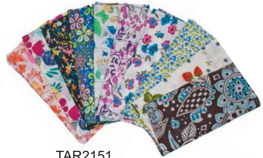
TAR2151 floral & fruits