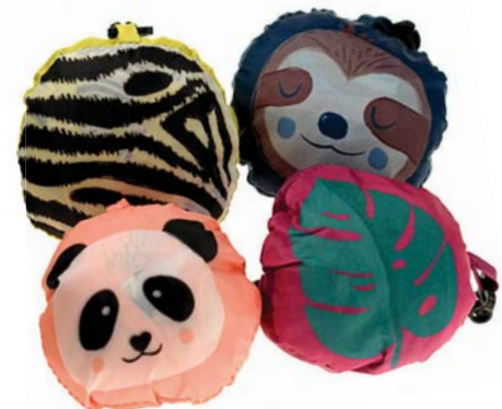
SDEA35738 shoppers box of 24 asst.