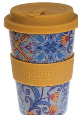
RH015 Marrakesh bestseller