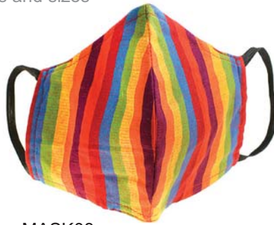
MASK08 PeoplesMask rainbow med MASK09 PeoplesMask rainbow lar