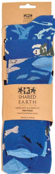
ASPA06LAR ASPA06MED sharks, turtles, seals