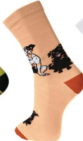
ASP080 LAR ASP080 MED dogs/walkies