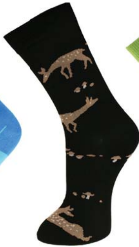
ASP2003 LAR ASP2003 MED deer