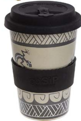
RH027 geckos & dragonfly bestseller