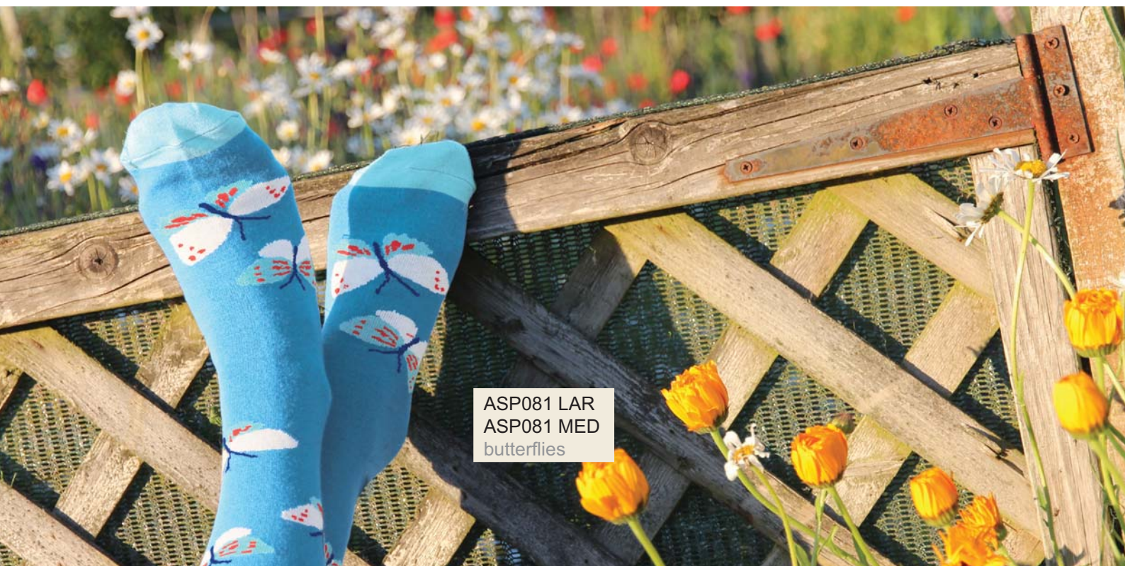
ASP081 LAR ASP081 MED butterflies