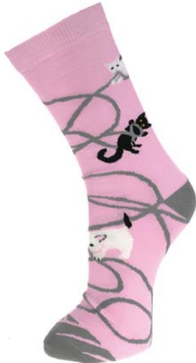
ASP033 LAR ASP033 MED kittens playing