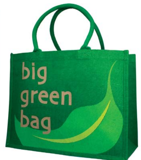
EA2109 big green bag 42x32x18cm