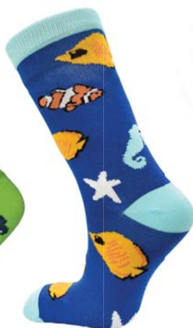
ASP2805LAR ASP2805MED coral fish