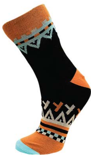
ASP2800LAR ASP2800MED black orange white and blue pattern