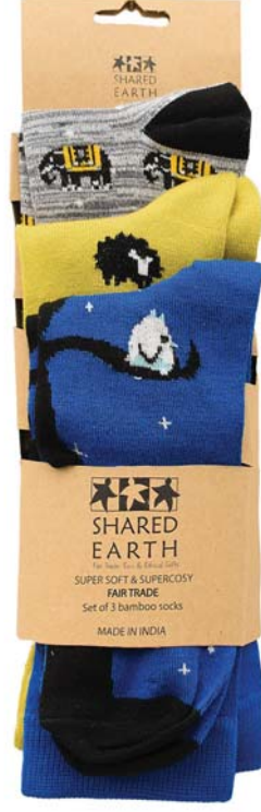
ASPA04LAR ASPA04MED elephants, sheep, owls