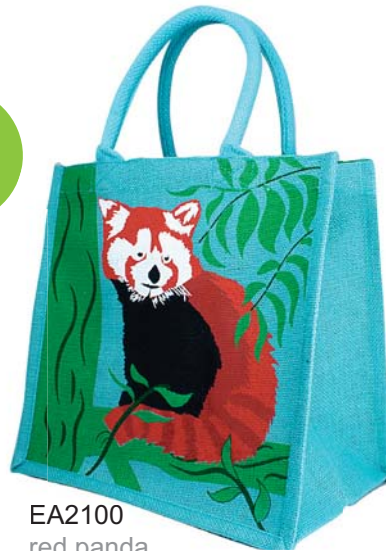
EA2100 red panda