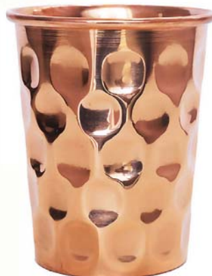
COP09 copper glass diamond 300ml