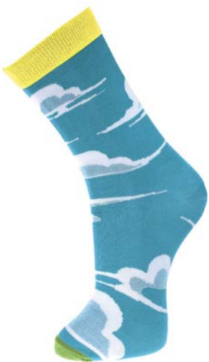
ASP2012 LAR ASP2012 MED clouds