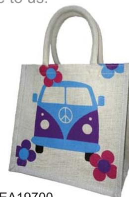
EA19700 camper van