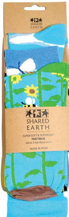
ASPA08LAR ASPA08MED clouds, butterflies, bees