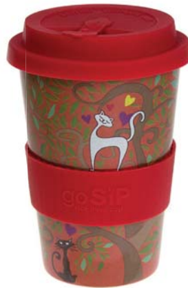
RH030 cats in love