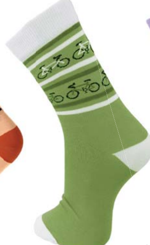
ASP18710 MED ASP18710 LAR men's bicycles