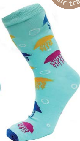
ASP2806LAR ASP2806MED jellyfish