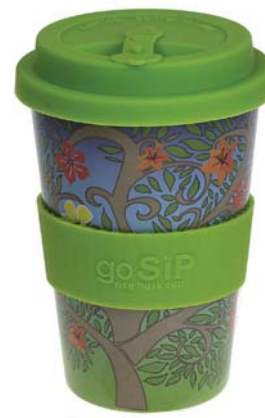
RH031 tree of life in bloom bestseller