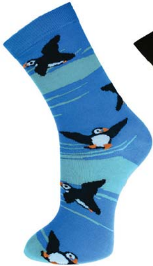
ASP2002 LAR ASP2002 MED puffins