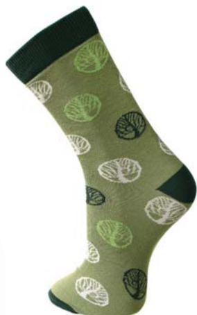
ASP18718 MED ASP18718 LAR tree of life