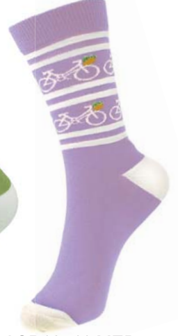
ASP18711 MED ASP18711 LAR ladies' bicycles