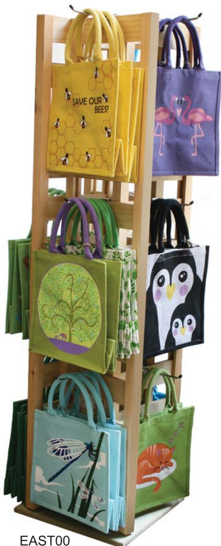
EAST00 POS display stand with 6 each x 24 jute bags