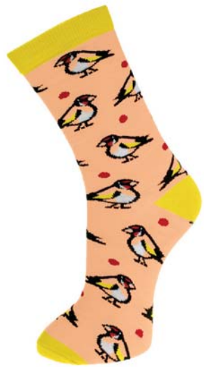
ASP031 LAR ASP031 MED goldfinches