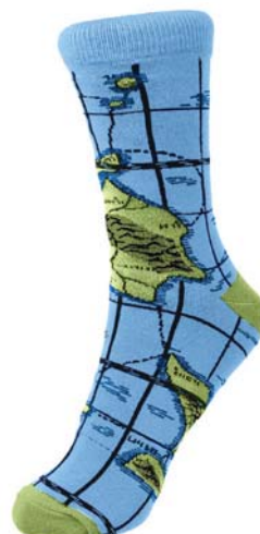
ASP18714 MED ASP18714 LAR globetrotter, green and blue