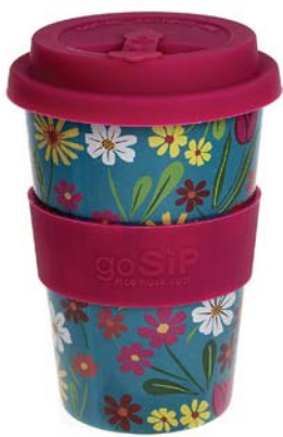
RH011 folk florals turquoise bestseller