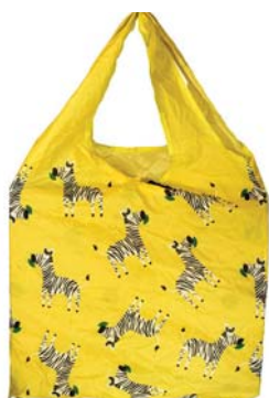
SDEA16838 shopper - zebra