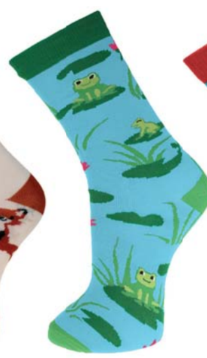
ASP2010 LAR ASP2010 MED frogs