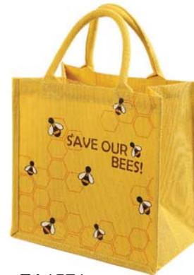
EA1571 save our bees TOP SELLER