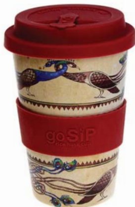
RH029 Lindisfarne peafowl bestseller