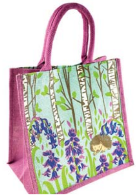
EA2004 hedgehogs & bluebells