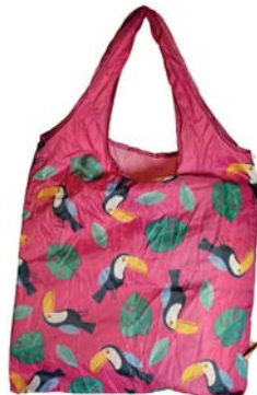
SDEA16938 shopper - toucan