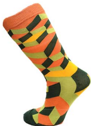
ASP2804LAR ASP2804MED cubes asst cols