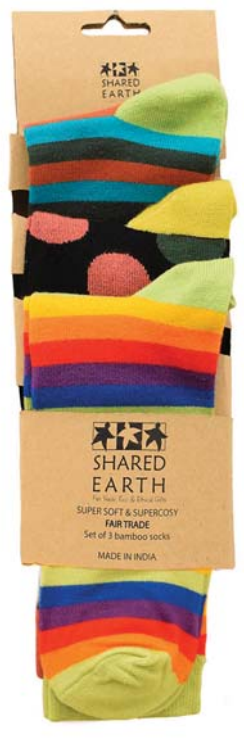
ASPA05LAR ASPA05MED stripes and polka dots