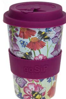
RH009 busy foxgloves bestseller