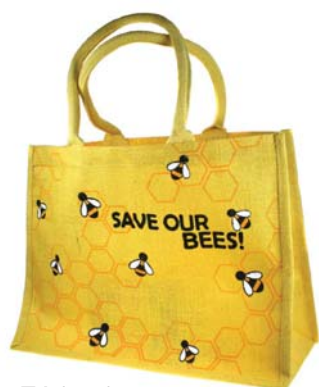
EA1771 save our bees 32x42x18cm