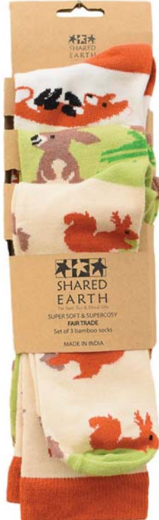
ASPA03LAR ASPA03MED foxes, rabbits, squirrels