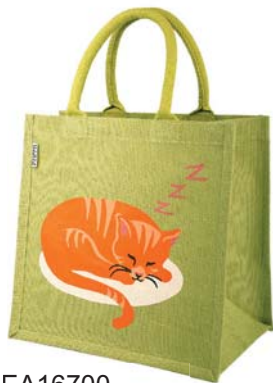
EA16700 cat sleeping