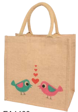
EA1400 birds in love