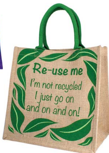
EA2107 re-use me