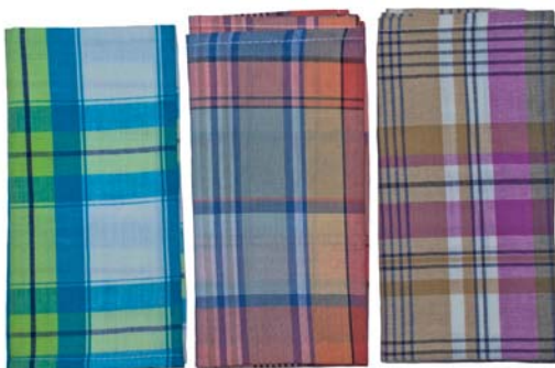
TAR2163 set of 3 checks