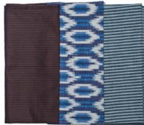
TAR2172 set of 3 stripes etc