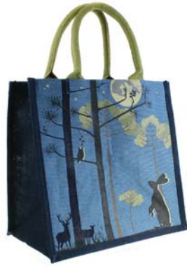
EA19702 hare & moon