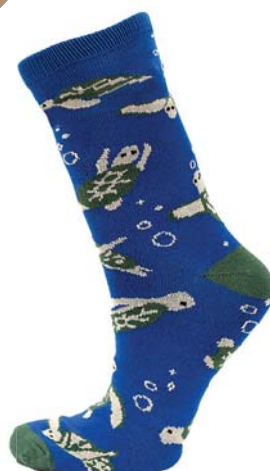
ASP2807LAR ASP2807MED turtles