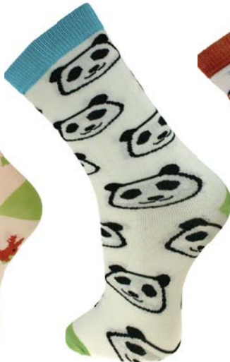
ASP2008 LAR ASP2008 MED pandas