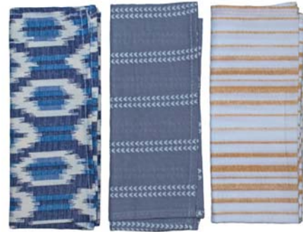
TAR2162 set of 3 stripes etc