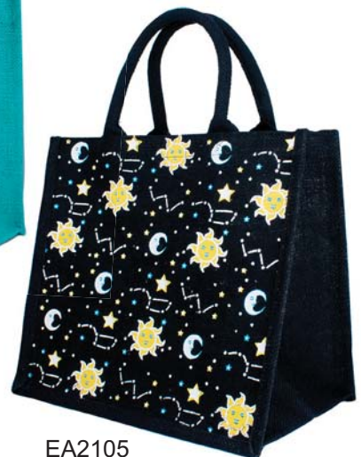
EA2105 suns and moons