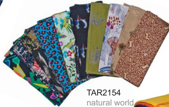
TAR2154 natural world