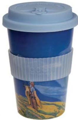
RH022 charaka pilgrim