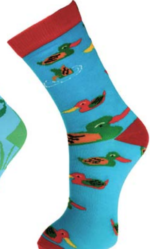
ASP2011LAR ASP2011MED ducks