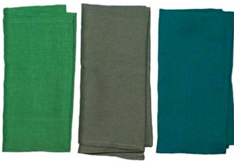
TAR2160 set of 3 plain