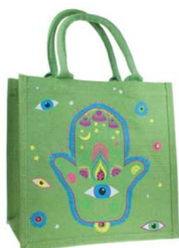
EA1903 hamsa hand

There are so many best-sellers in this range that you can't go wrong- all created by our in-house designers and unique to us.