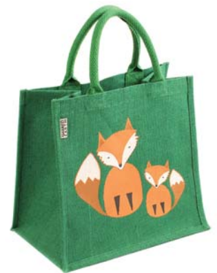
EA1572 fox & cub