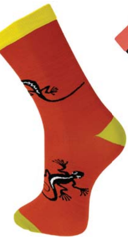
ASP041 LAR ASP041 MED geckos