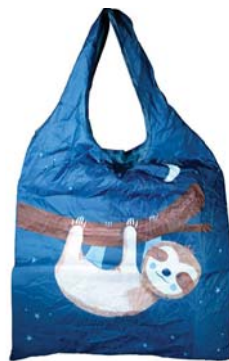
SDEA17038 shopper - sloth