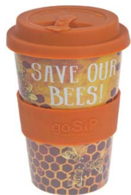
RH032 save our bees TOP SELLER