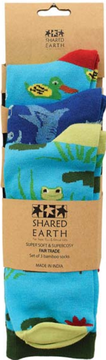
ASPA01LAR ASPA01MED ducks, sharks, frogs