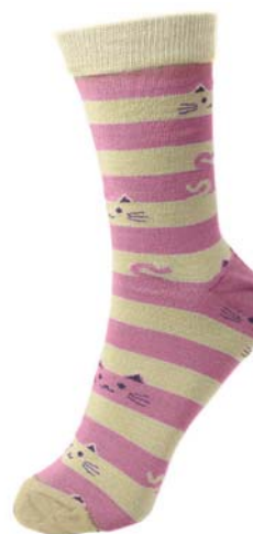
ASP18728 MED ASP18728 LAR cheeky cats