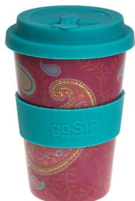
RH016 paisley masala