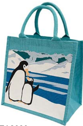
EA2080 penguin and chick