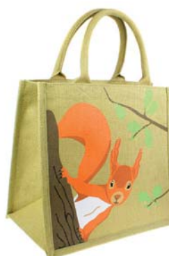
EA1873 red squirrel