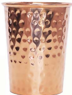
COP08 copper glass hammered 300ml