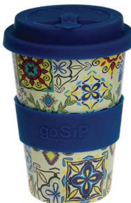
RH014 cadiz bestseller