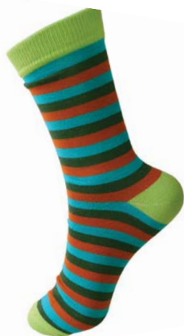
ASP18726 MED ASP18726 LAR stripes: turq, terracota, green