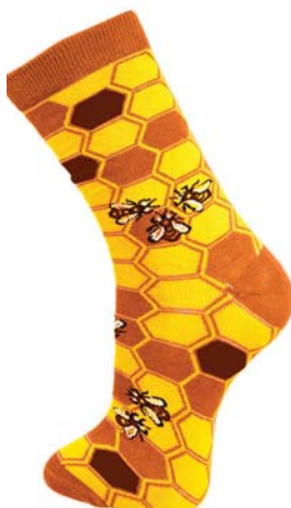
ASP18719 MED ASP18719 LAR save our bees