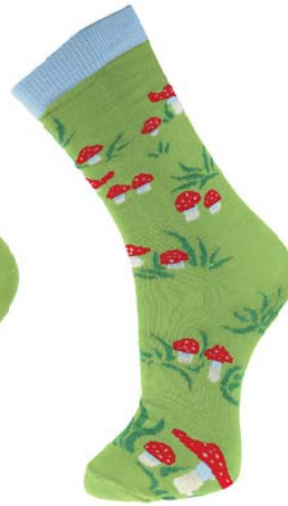
ASP2005 LAR ASP2005 MED mushrooms