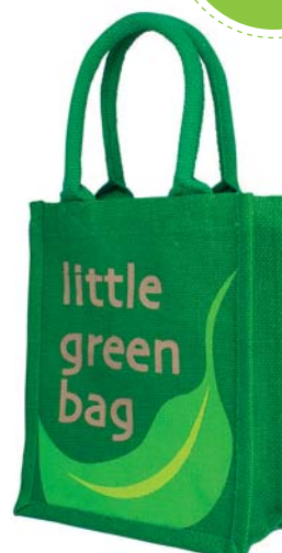
EA2108 little green bag 26x21x10cm