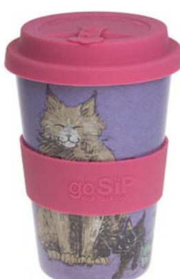
RH018 feline fun bestseller