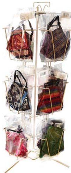
MASK06-6ASPIN12 12 pocket counter spinner MASK06-6A asst cols & sizes x 200 30 inches ht