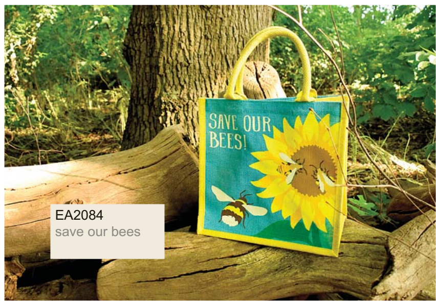
EA2084 save our bees