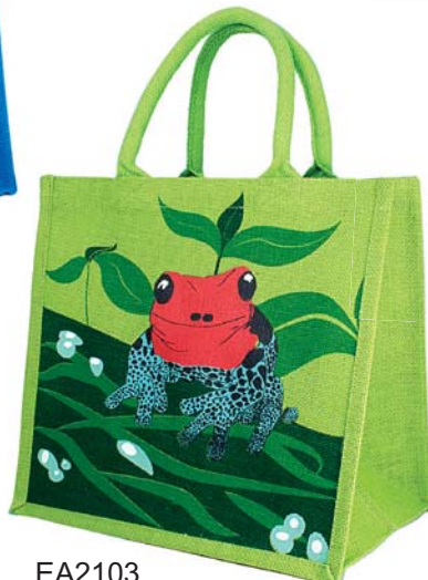
EA2103 poison tree frog