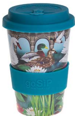
RH010 lily pond