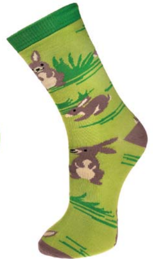
ASP2006 LAR ASP2006 MED rabbits