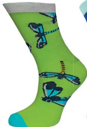
ASP2809LAR ASP2809MED damselflies