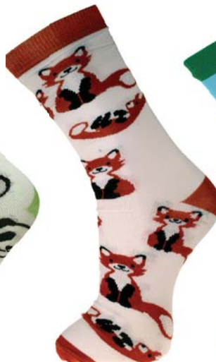
ASP2009 LAR ASP2009 MED foxes