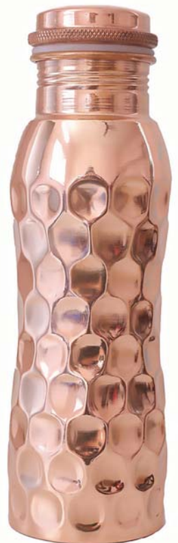
COP03 copper water bottle diamond 600ml