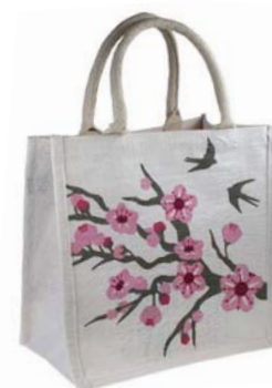
EA1803 cherry blossoms