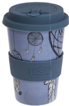
RH028 dreamcatcher dusk