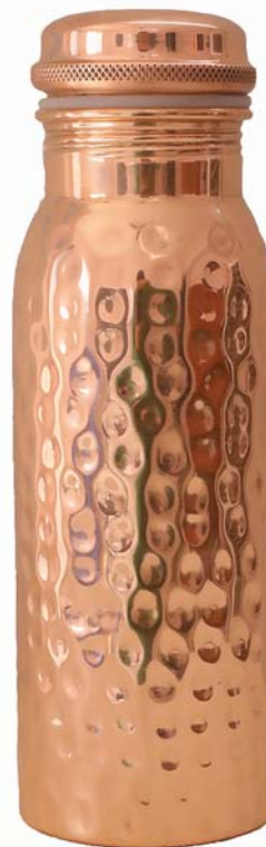
COP02 copper water bottle hammered 600ml