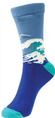
ASP18727 MED restless sea & albatross