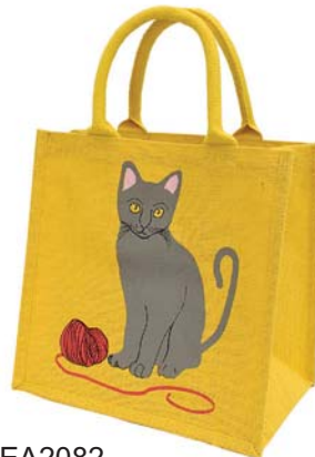
EA2082 cat and wool