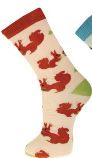
ASP2007 LAR ASP2007 MED squirrels