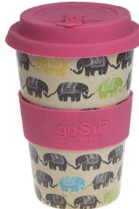
RH025 dare to be different bestseller