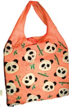
SDEA17138 shopper - panda