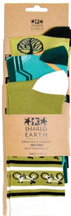
ASPA09LAR ASPA09MED trees, bikes, circuitboard