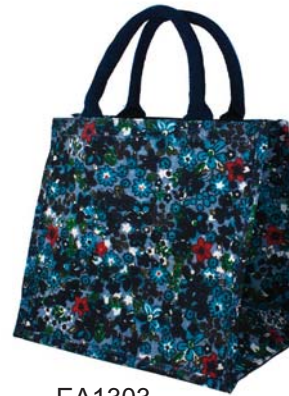
EA1303 floral blue