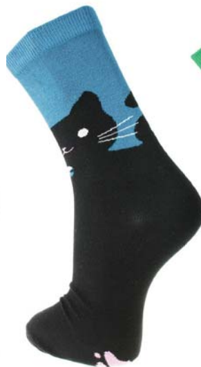
ASP034 LAR ASP034 MED cats with paws