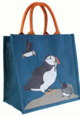
EA19703 puffin with chick