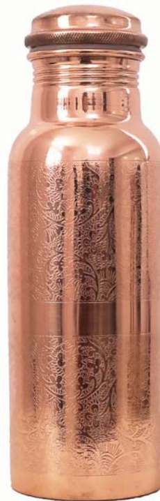
COP01 copper water bottle engraved 600ml

In the sea, they break down into micro-plastics, containing toxins (which are used in many plastics, to increase their durability) and absorbing pollutants from the sea. Eaten by fish, they affect the food chain and eventually ourselves.