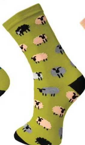
ASP079 LAR ASP079 MED sheep