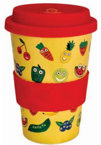
RH049 fruit and vegetable faces