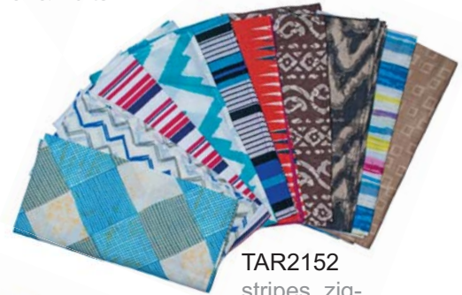
TAR2152 stripes, zig- zag, geometric