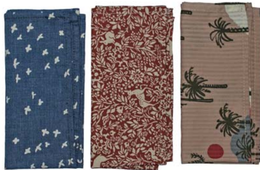
TAR2164 set of 3 natural world