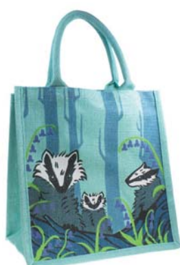
EA1900 badgers and bluebells