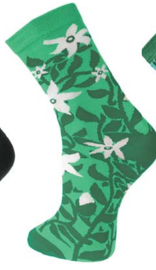
ASP036 LAR ASP036 MED vines & flowers