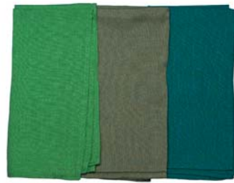
TAR2170 set of 3 plain

We present here a new range of eco-friendly products from India, made with recycled saris. Knot wrap is a great alternative to normal giftwrap – it looks fantastic and instead of being thrown away, it can be used again and again.