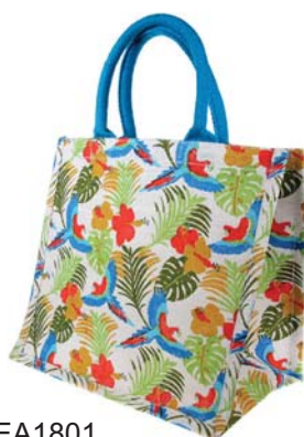
EA1801 tropical forest