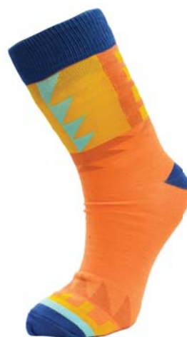
ASP2802LAR ASP2802MED oranges yellow blues pattern