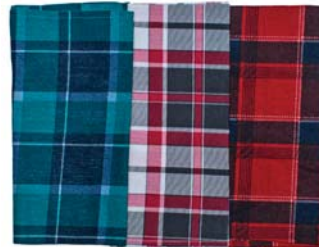
TAR2173 set of 3 checks