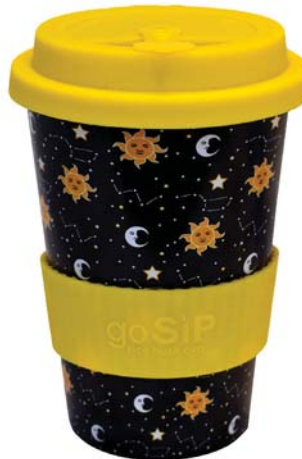
RH057 suns and moons