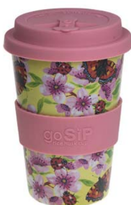
RH007 tortoiseshells & flowers