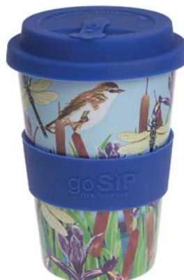
RH008 warblers & dragonflies