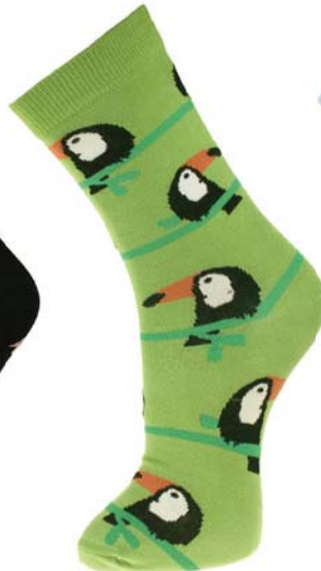
ASP2004 LAR ASP2004 MED toucans