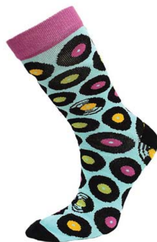
ASP2803LAR ASP2803MED record discs