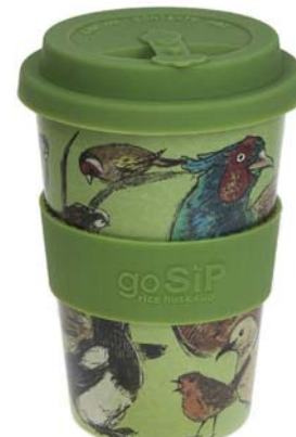
RH020 birds in garden bestseller