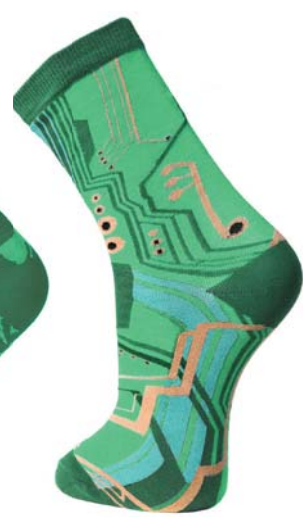
ASP037 LAR ASP037 MED circuit board