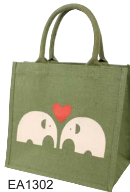
EA1302 elephants in love

Standard size for jute bags is 30x30x20cm