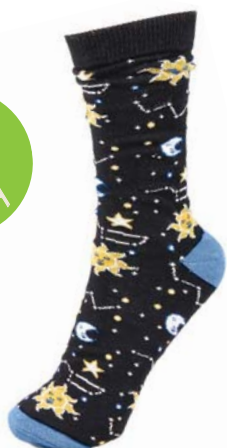
ASP18716 MED ASP18716 LAR celestial