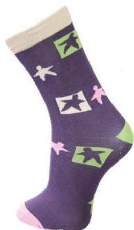
ASP18725 MED ASP18725 LAR dancing people