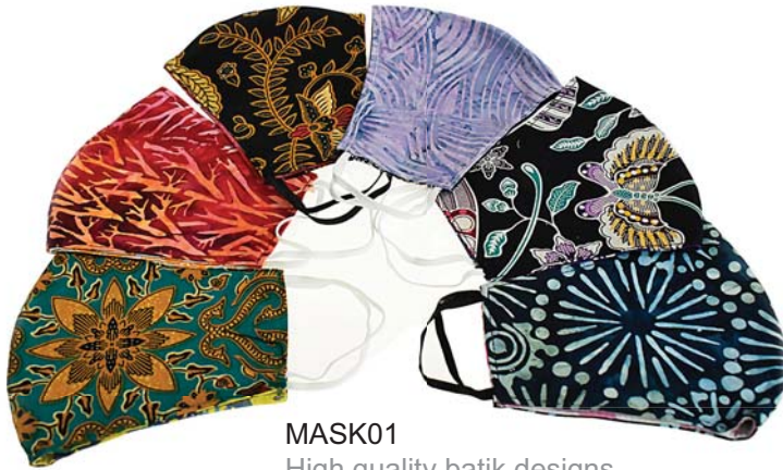
MASK01 High quality batik designs from Indonesia asst. designs and sizes