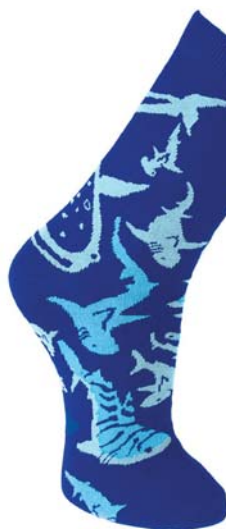
ASP027 LAR ASP027 MED sharks