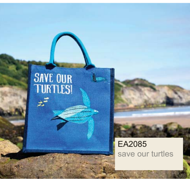
EA2085 save our turtles