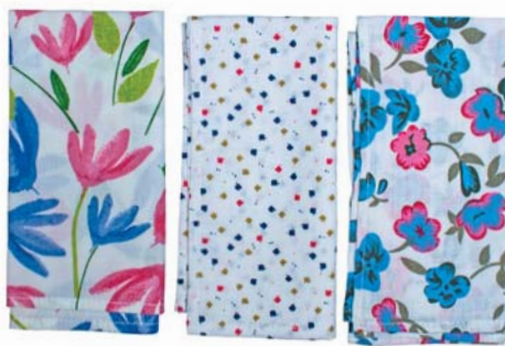
TAR2161 set of 3 floral & fruits